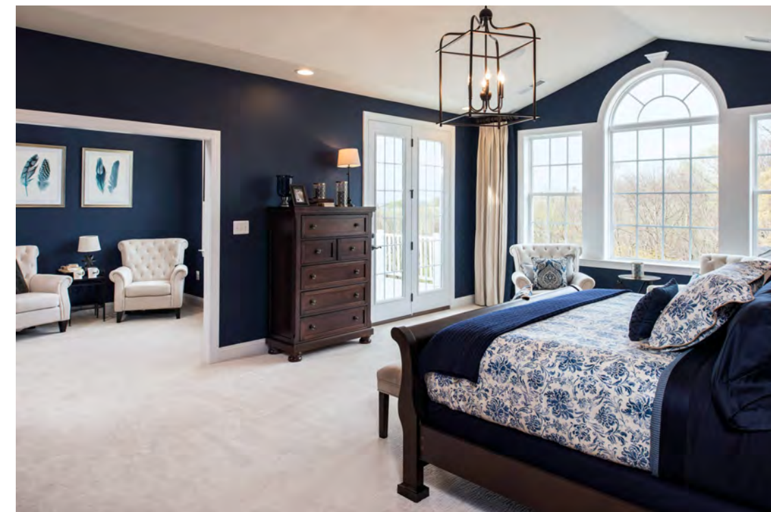
Owner's suite with sitting room and French doors leading to private deck

Photos of decorated model homes show structural and product options that are not included in the base price of a home. Photos are for illustrative and informational purposes only and are not part of or included in any contract. Blueprints take precedence over marketing materials. Plans, elevations, standard features, and options are subject to change without notice. See Sales Manager for details. 2/4/2022