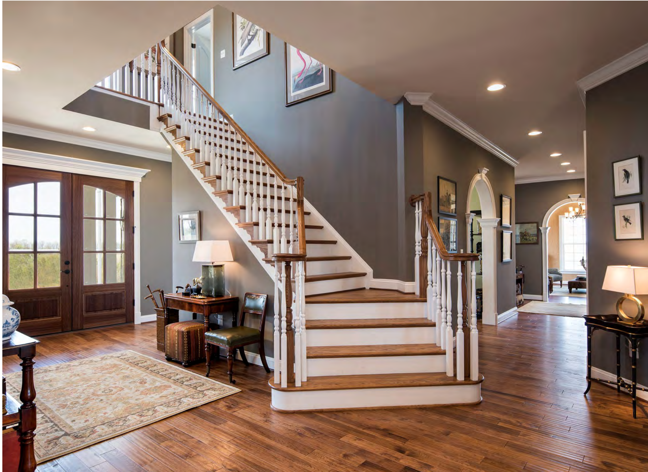
Walnut Glen stunning foyer and art gallery with reverse staircase

Photos of decorated model homes show structural and product options that are not included in the base price of a home. Photos are for illustrative and informational purposes only and are not part of or included in any contract. Blueprints take precedence over marketing materials. Plans, elevations, standard features, and options are subject to change without notice. See Sales Manager for details. 2/4/2022