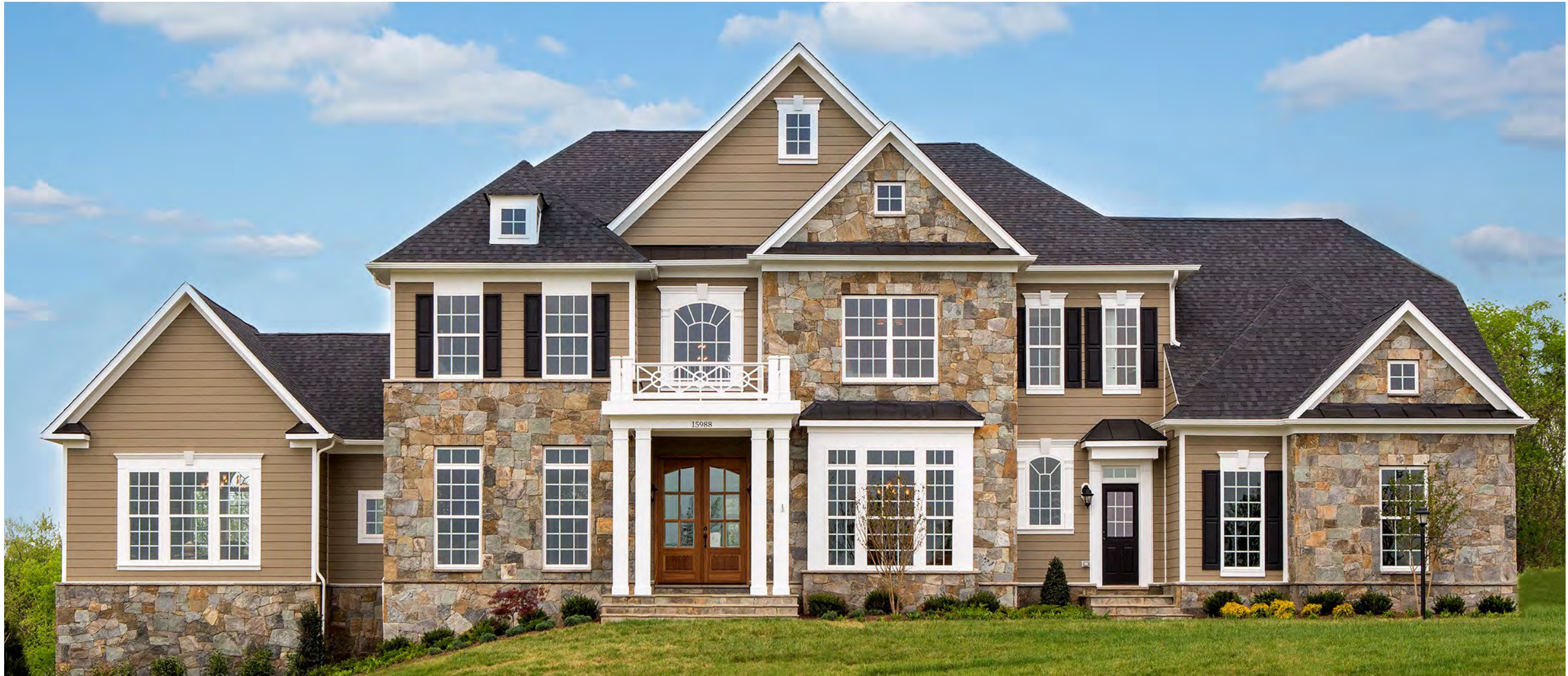
Elevation 3A shown with optional stone, double mahogany front doors, and side club room