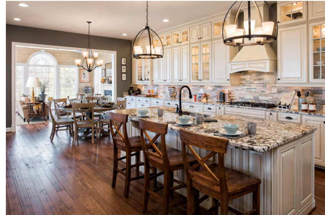
Kitchen with oversized island, upgraded stacked and glass cabinets, and optional keeping room