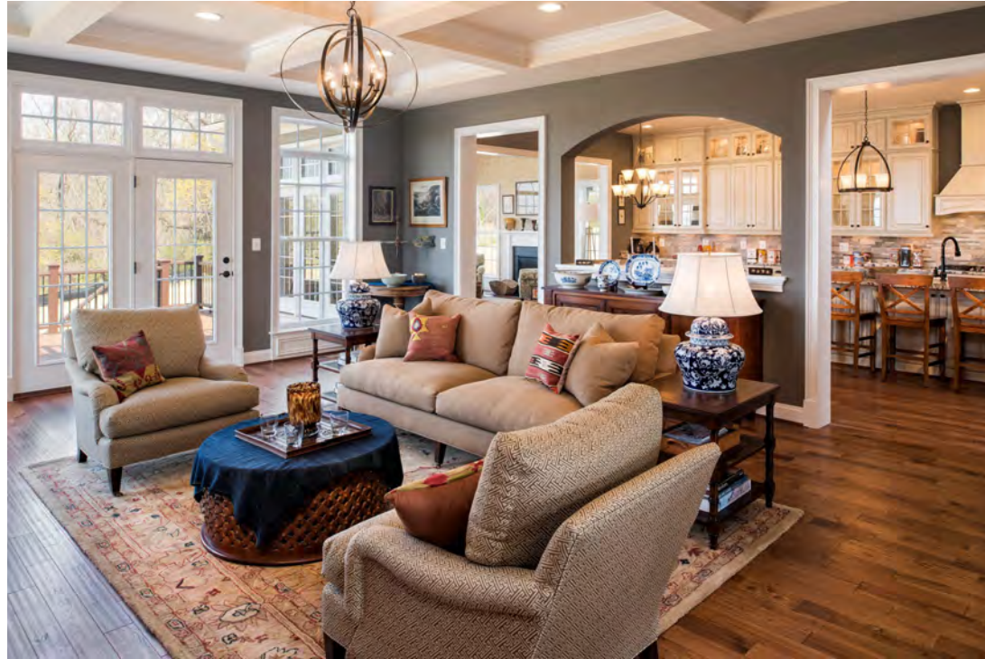
Family room with coffered ceiling and French doors