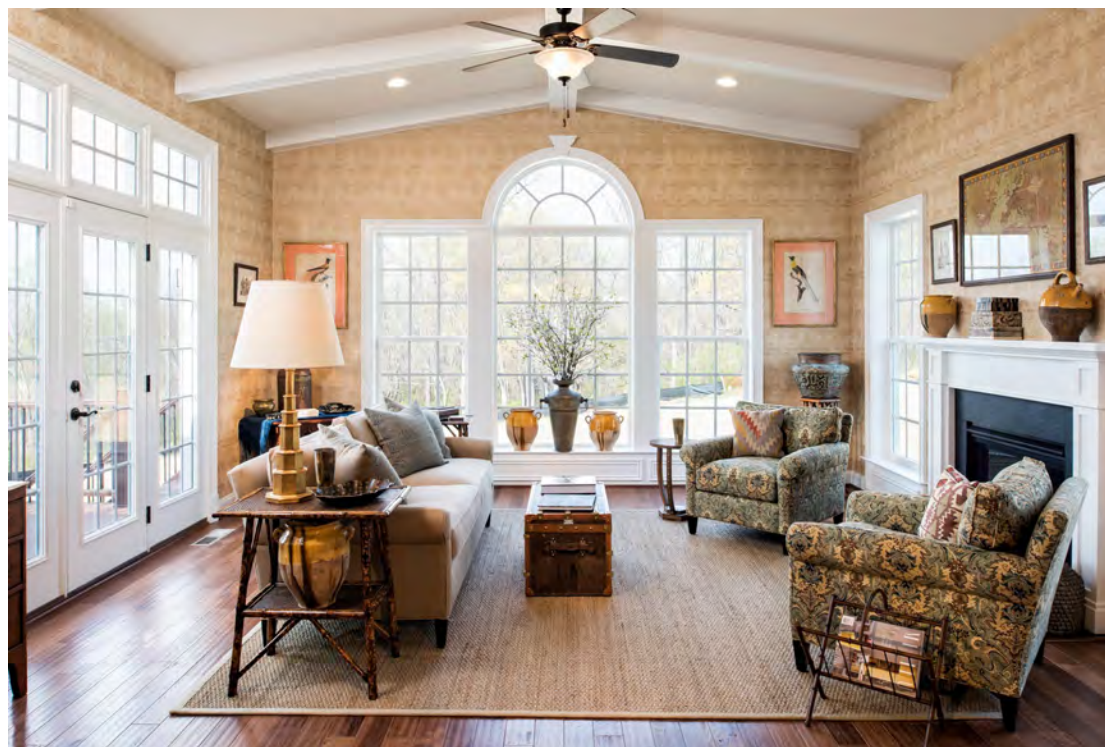
Optional keeping room with vaulted, beamed ceiling, gas fireplace, and French doors leading to Trex deck