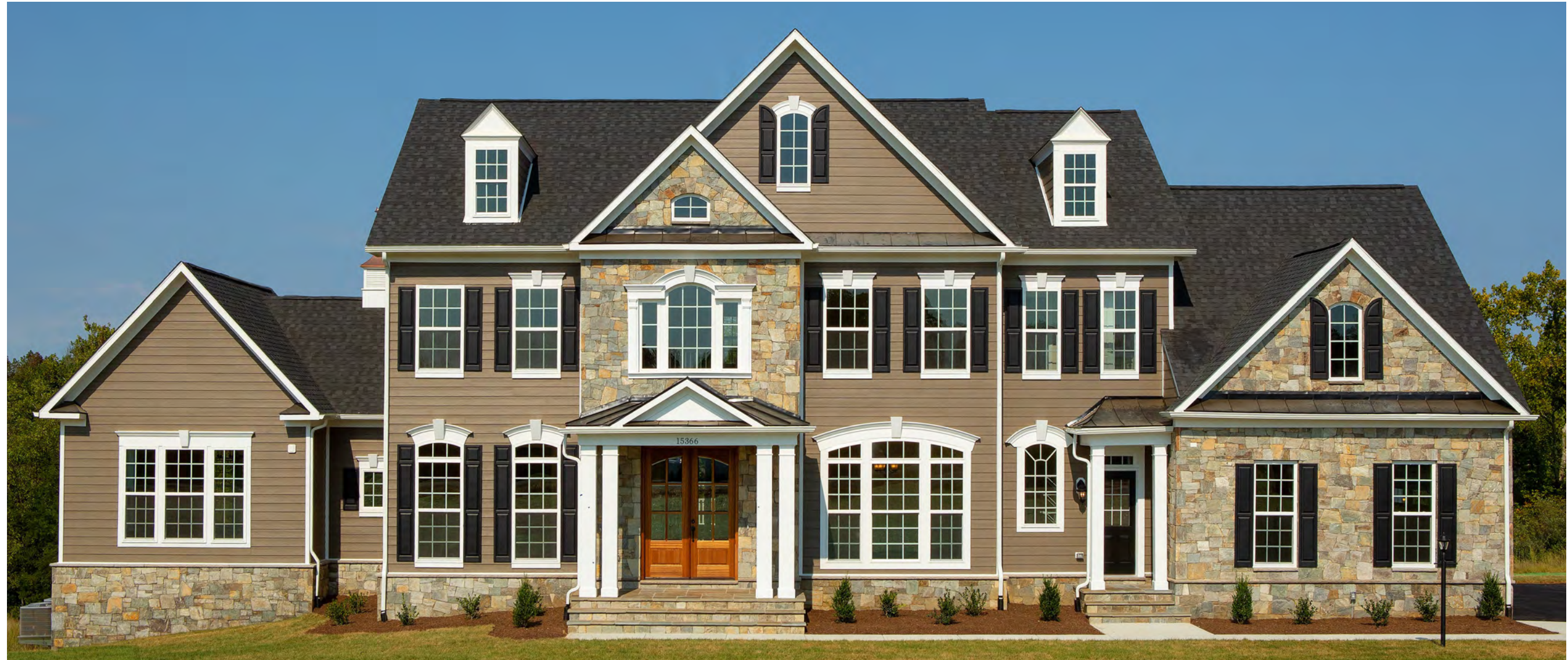
Elevation 4A shown with optional stone, mahogany double doors, and side club room