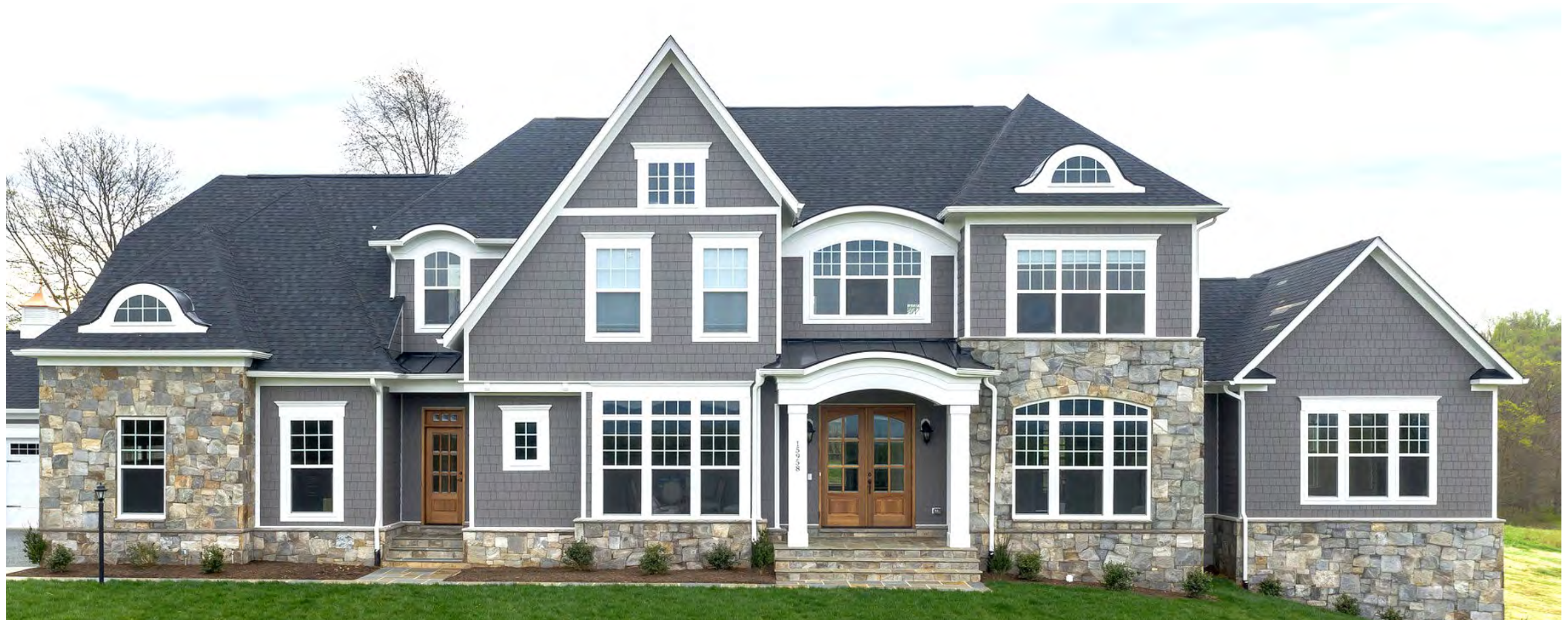
Elevation 8A shown with optional stone, mahogany doors, and side club room