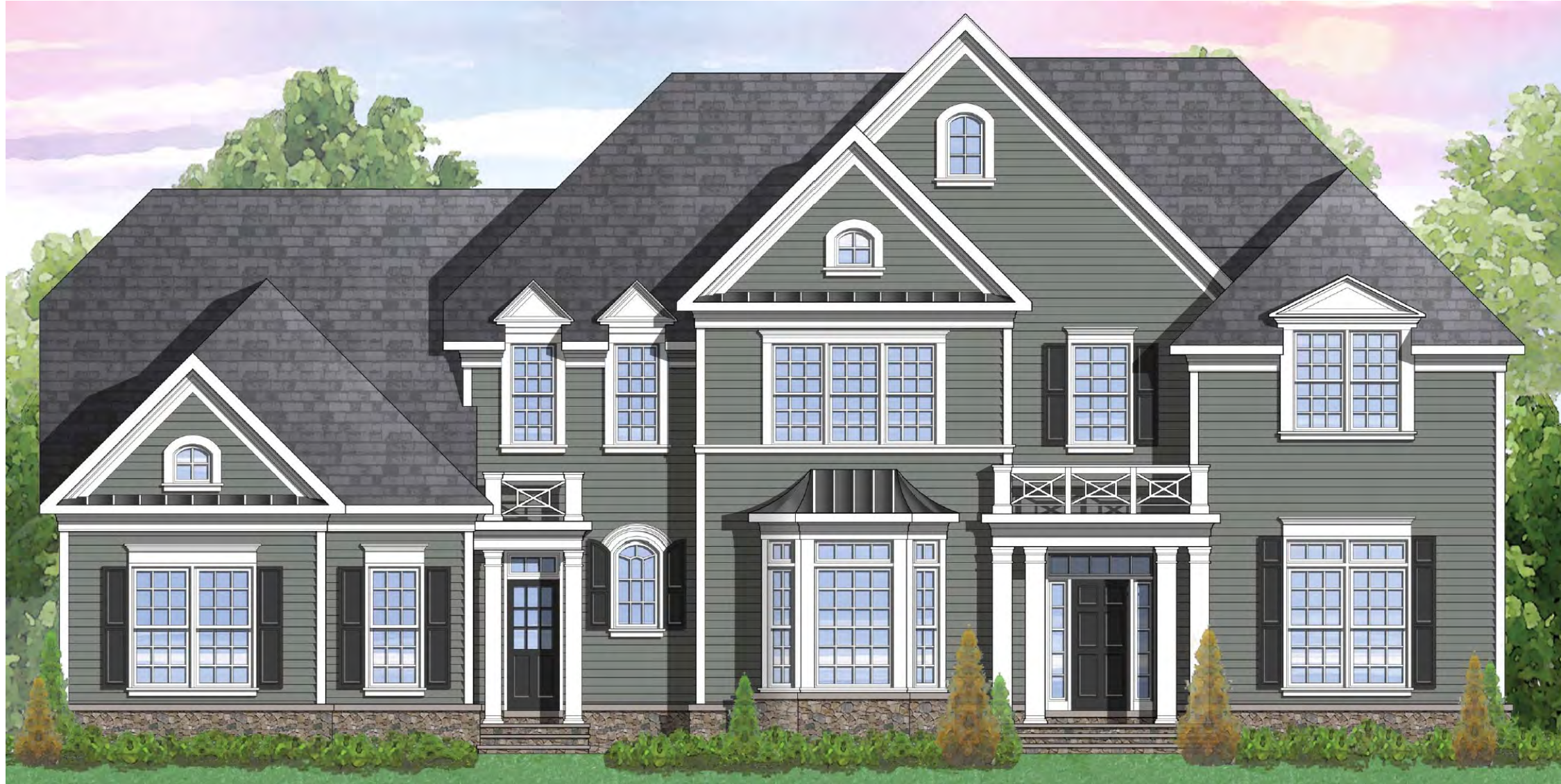
Elevation 10A shown with optional stone water table