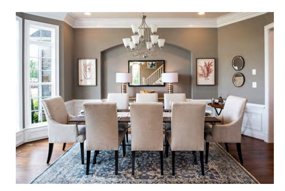
Dining room with bay window and art/furniture niche