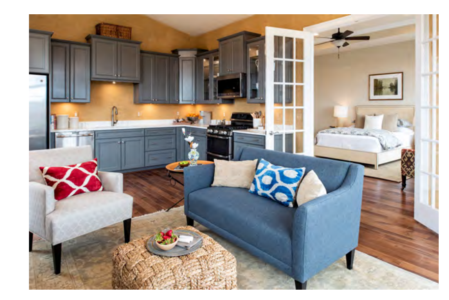
Optional multi-generational suite with kitchen, living space, bedroom, and full bath