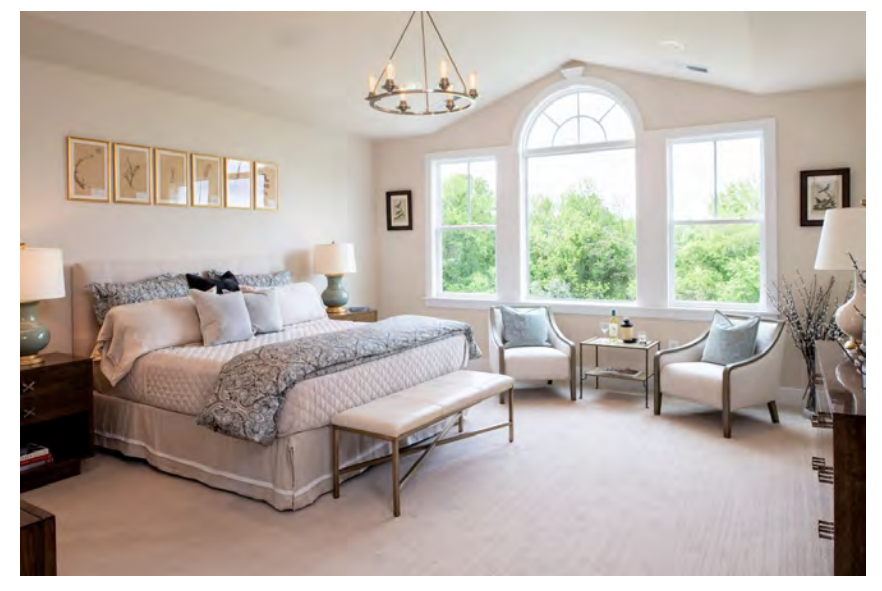
Owner's suite with vaulted ceiling and arched window wall