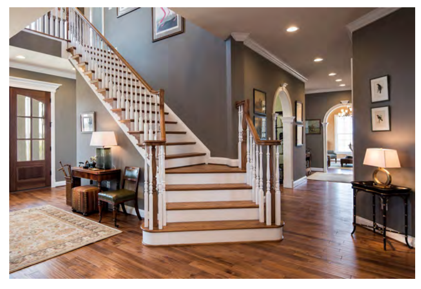
Dramatic foyer with reverse staircase