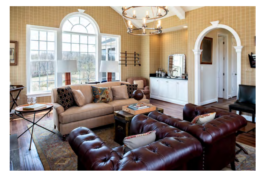
Optional side club room with vaulted ceiling

Photos of decorated model homes show structural and product options that are not included in the base price of a home. Photos are for illustrative and informational purposes only and are not part of or included in any contract. Blueprints take precedence over marketing materials. Plans, elevations, standard features, and options are subject to change without notice. See Sales Manager for details. 8/12/2021