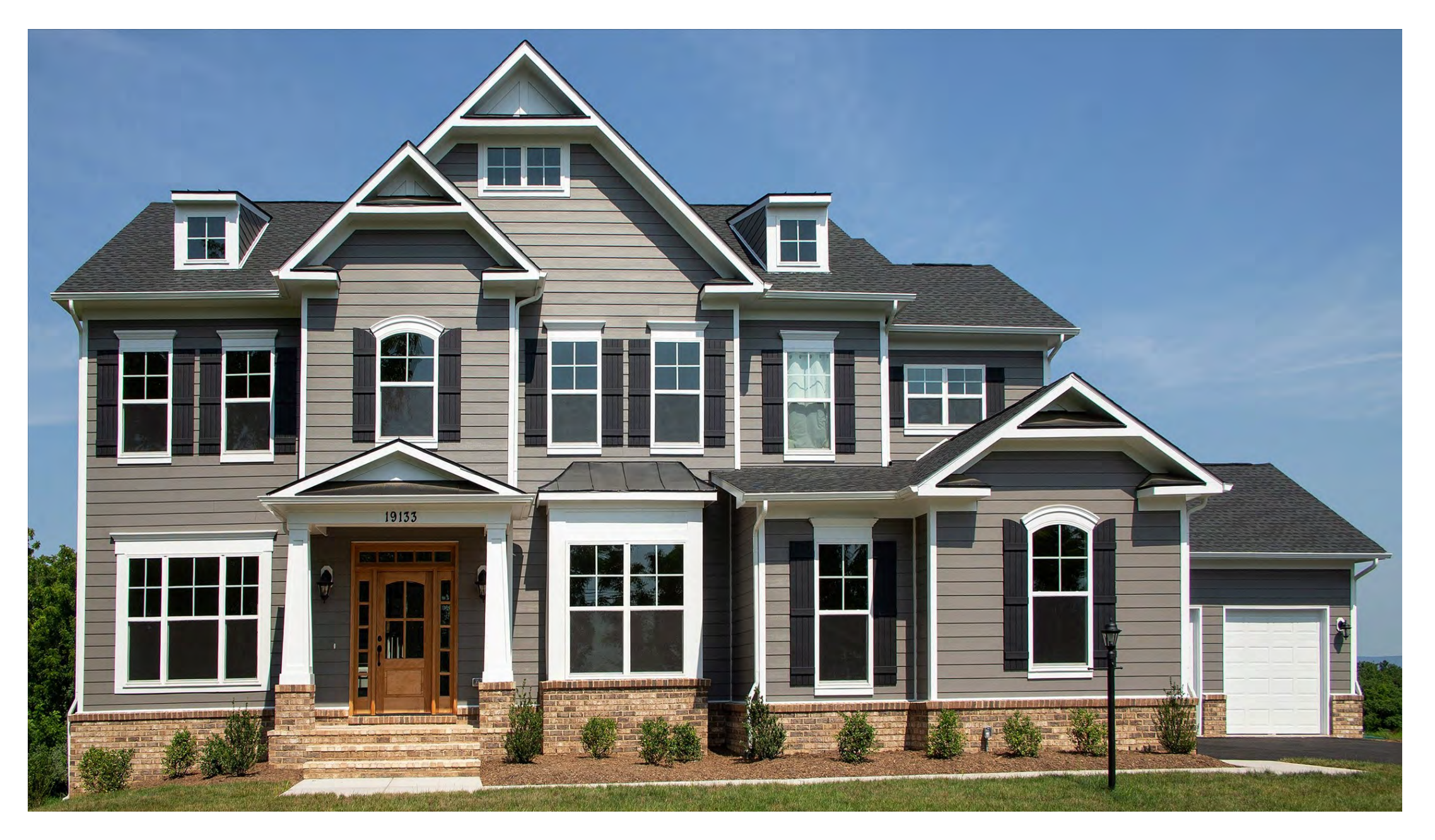
Elevation 10A shown with optional mahogany front door and four-car garage