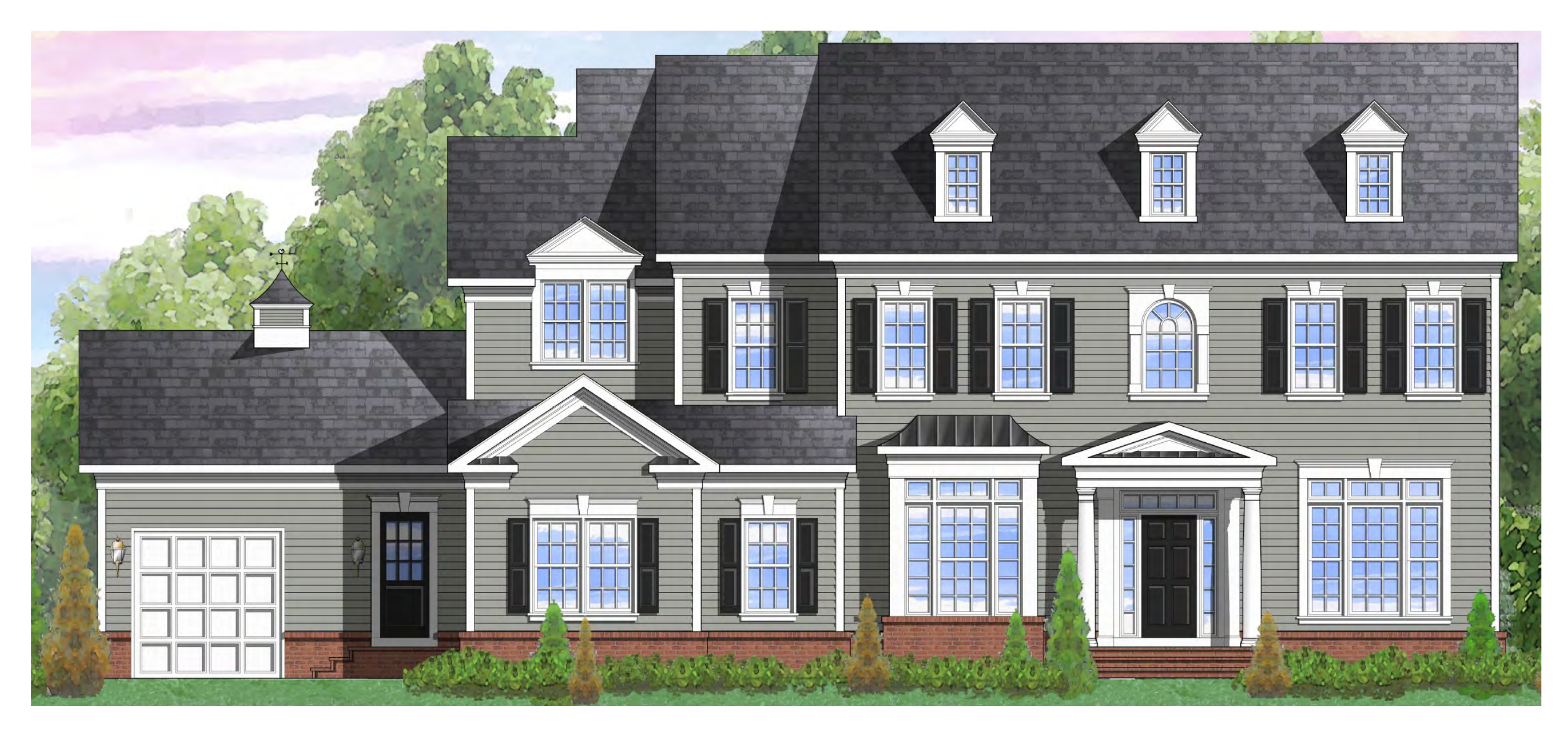
Elevation 23A shown with optional three-car garage and cupola with weathervane