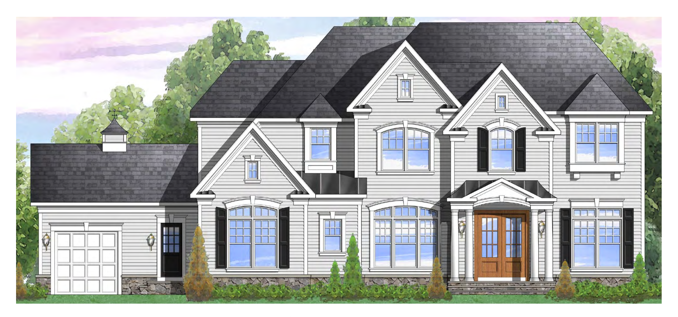
Elevation 18A shown with optional double mahogany front doors, three-car garage, stone water table, and cupola with weathervane