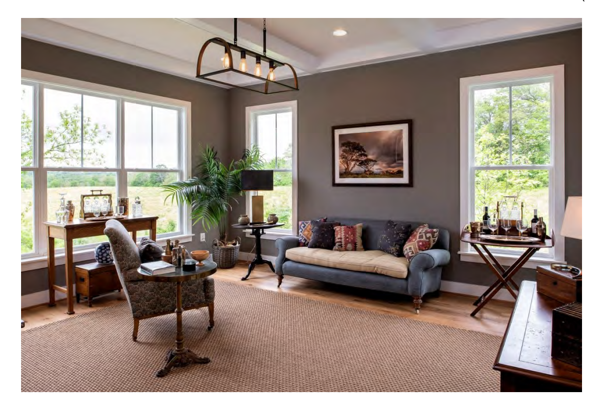
Flex room can be optioned into a club room with beamed ceiling