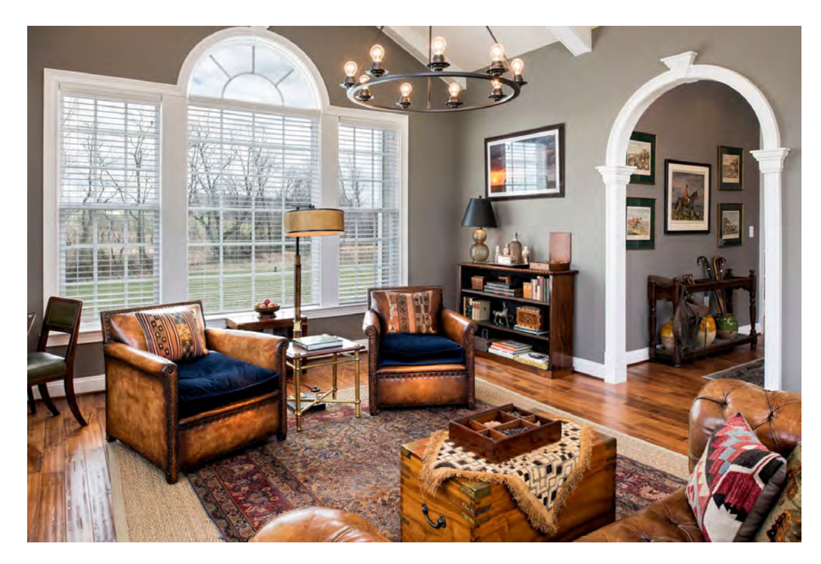
Optional side club room with vaulted beamed ceiling and trimmed arch to art gallery