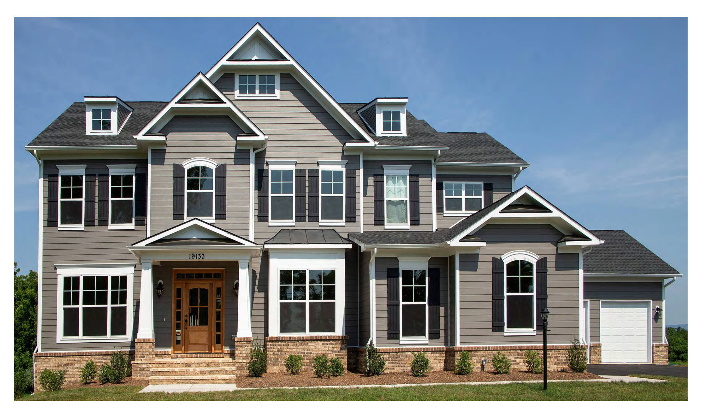
Elevation 10A shown with optional mahogany front door and four-car garage