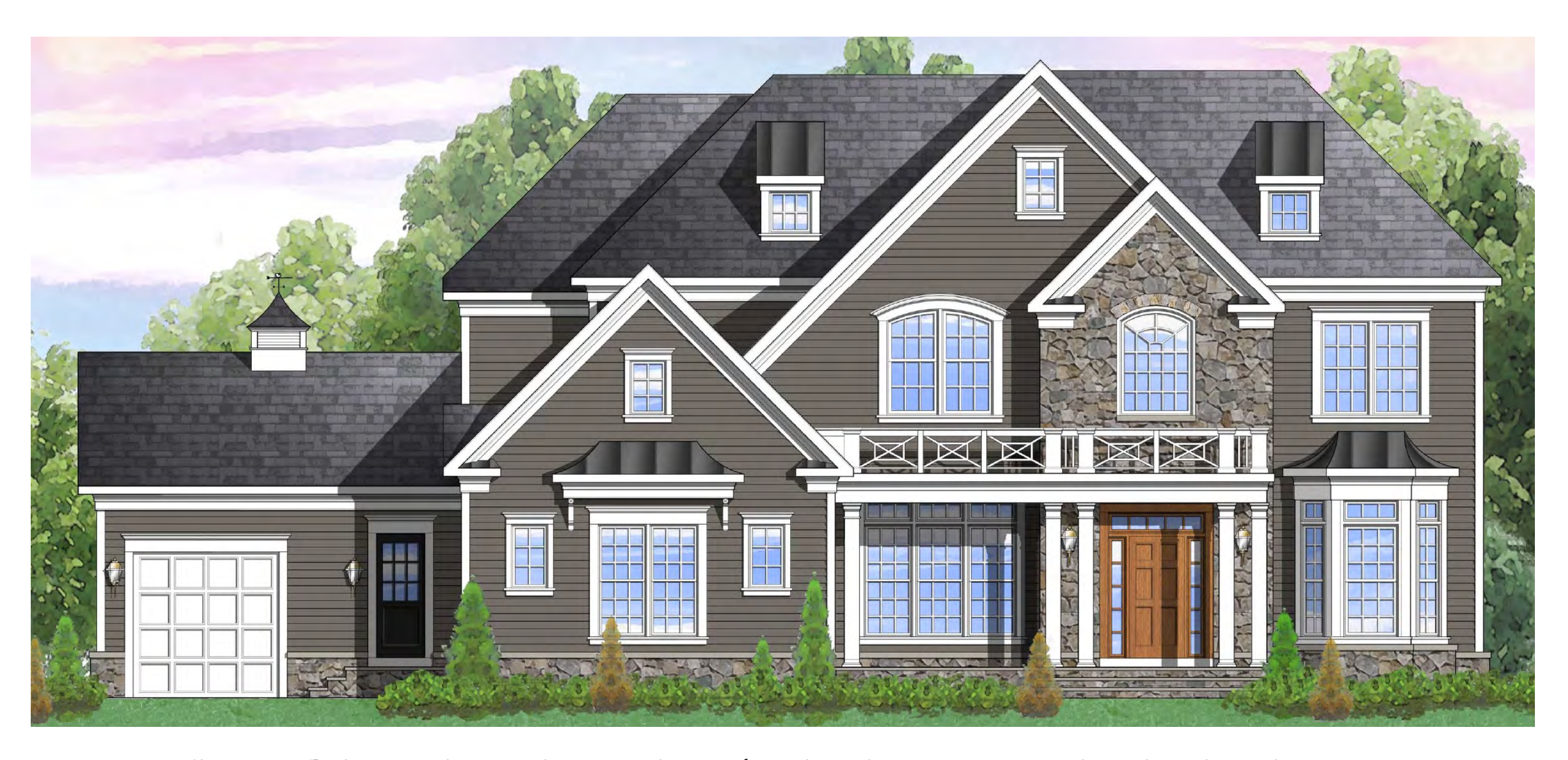
Elevation 19B shown with optional stone, mahogany front door, three-car garage, and cupola with weathervane