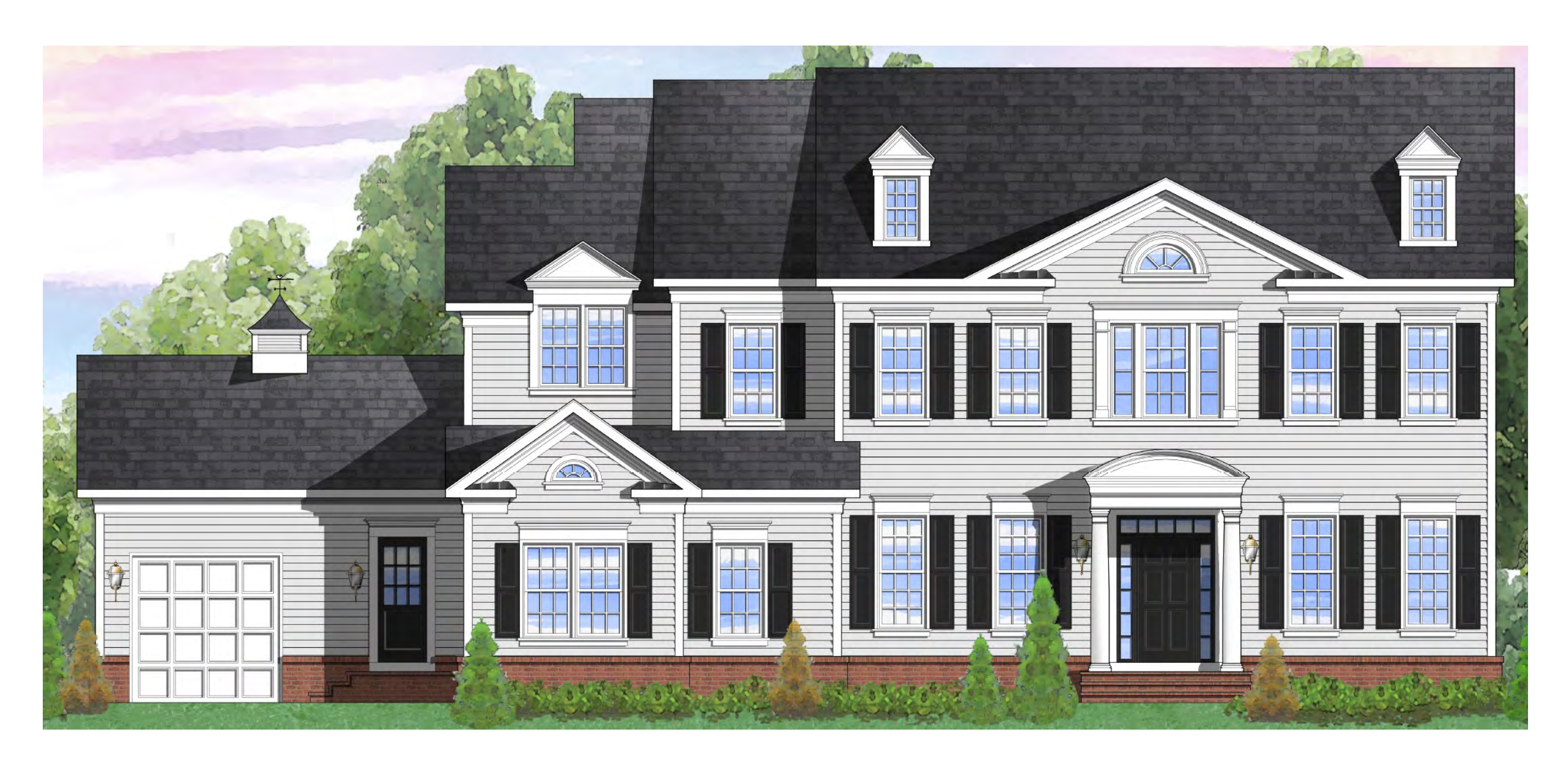
Elevation 2A shown with optional three-car garage and cupola with weathervane