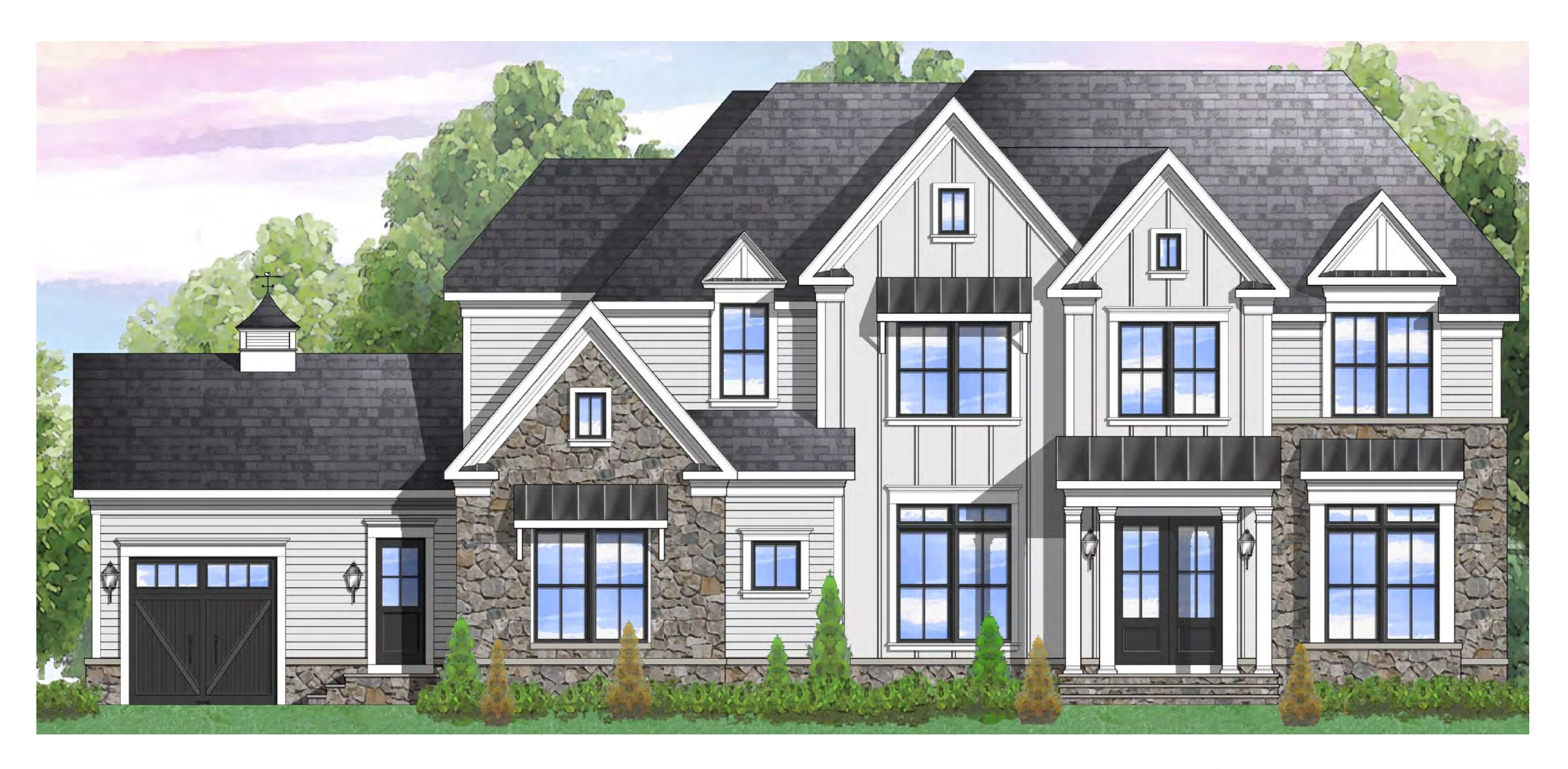
Elevation 27A shown with optional stone, board and batten, black windows, double mahogany front doors, three-car garage with carriage-style doors, and cupola with weathervane