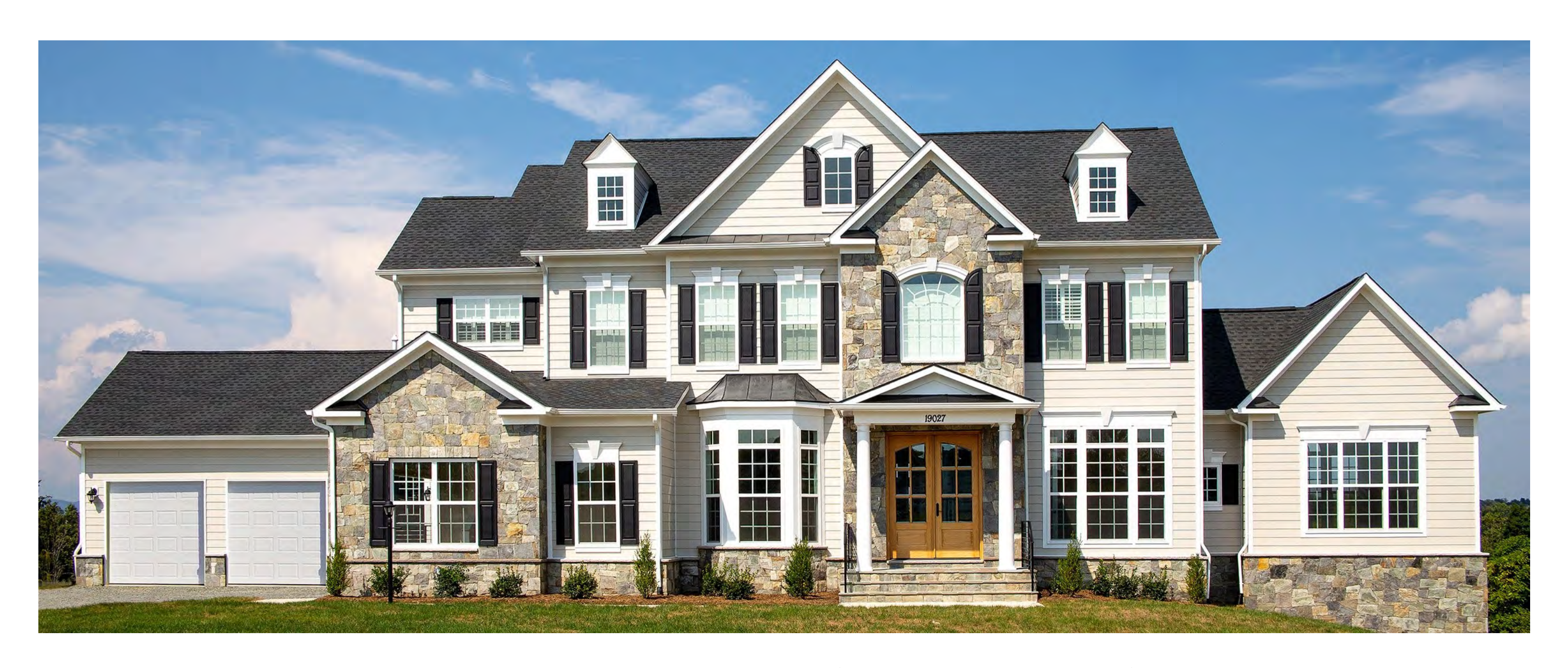
Elevation 12A shown with optional stone, double mahogany front doors, side club room, and four car garage