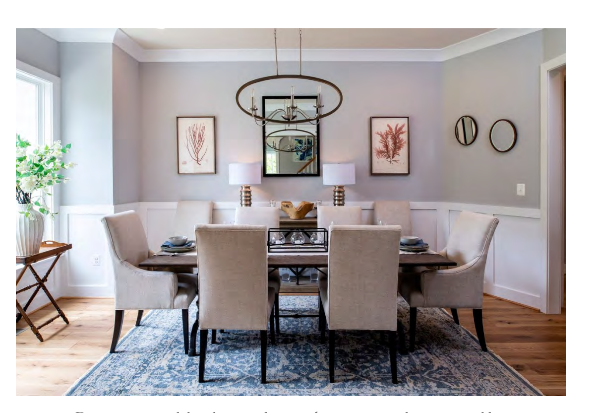
Dining room with box bay window, craftsman trim, and crown moulding