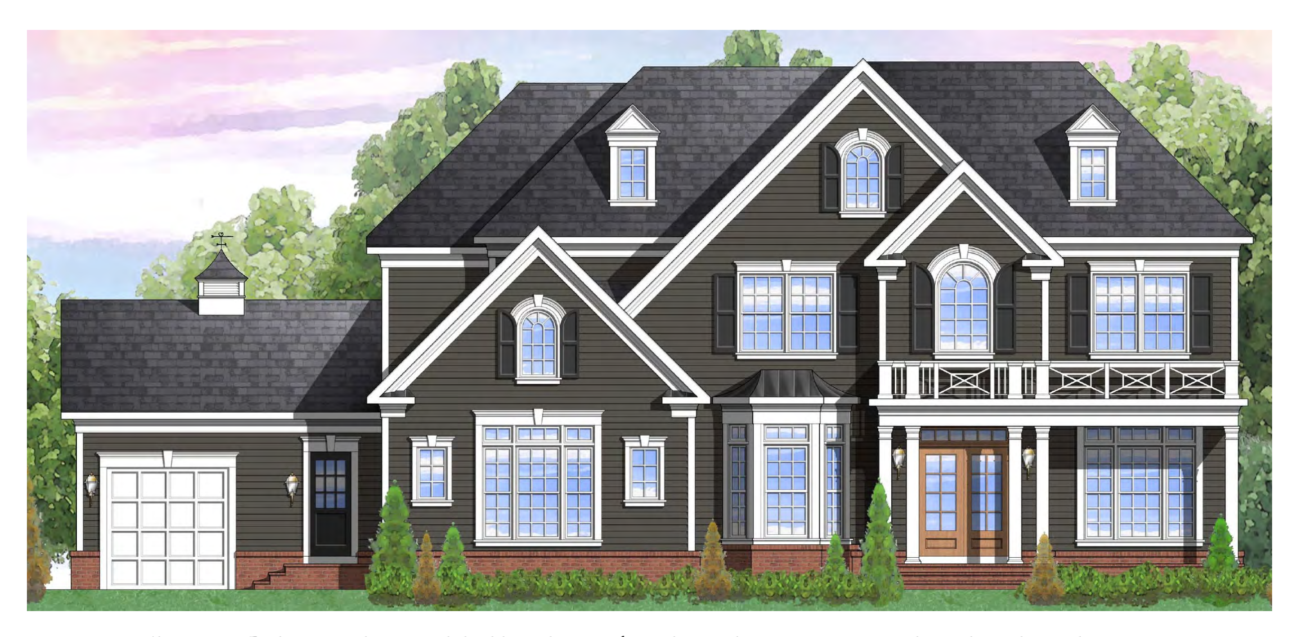
Elevation 21B shown with optional double mahogany front doors, three-car garage, and cupola with weathervane