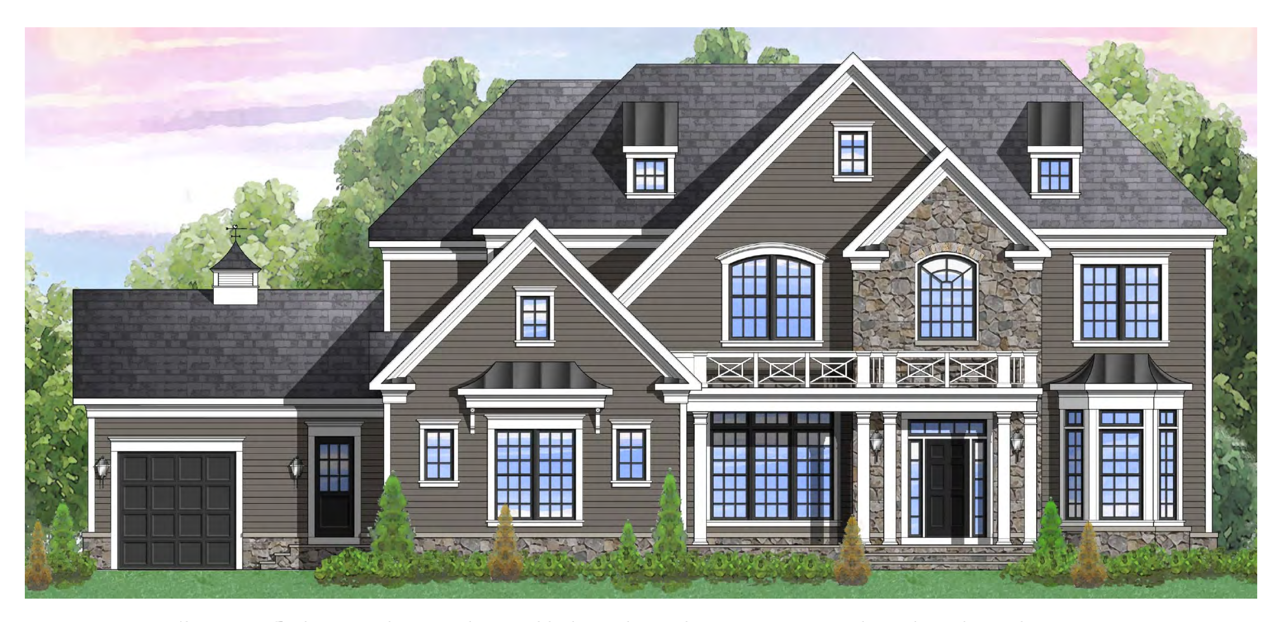
Elevation 19B shown with optional stone, black windows, three-car garage, and cupola with weathervane