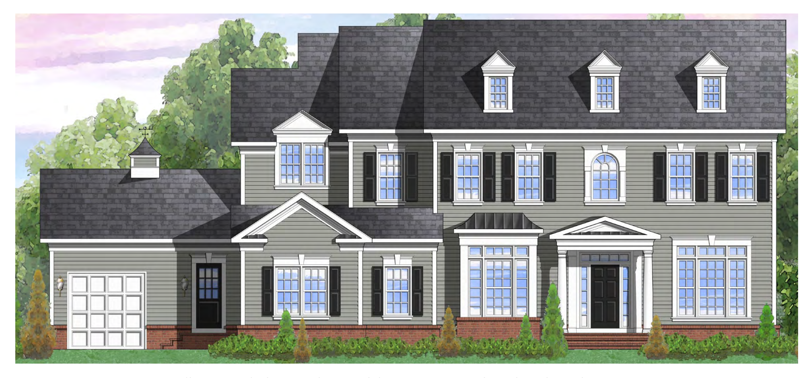
Elevation 23A shown with optional three-car garage and cupola with weathervane