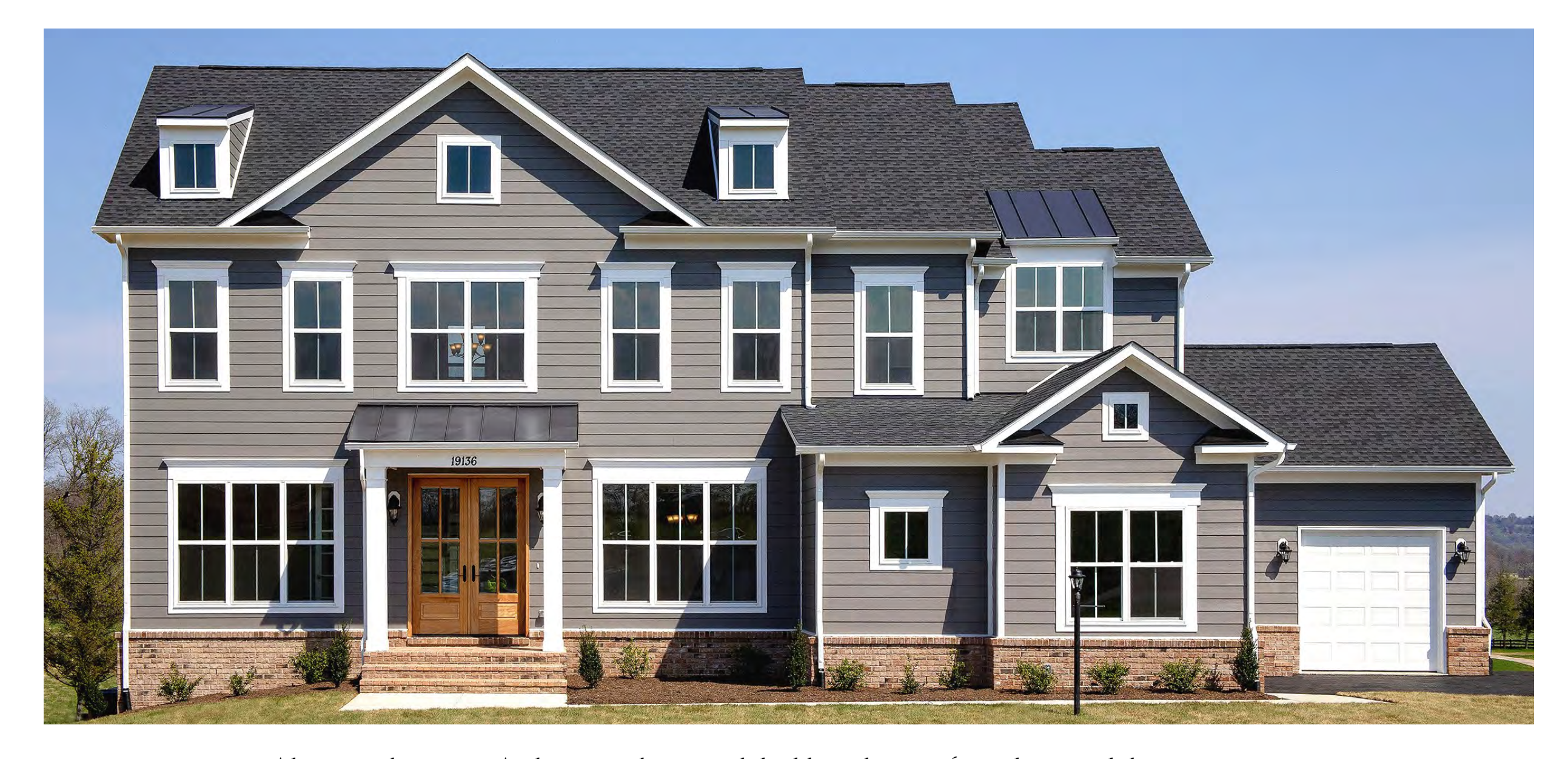
Alternate elevation 2A shown with optional double mahogany front doors and three-car garage