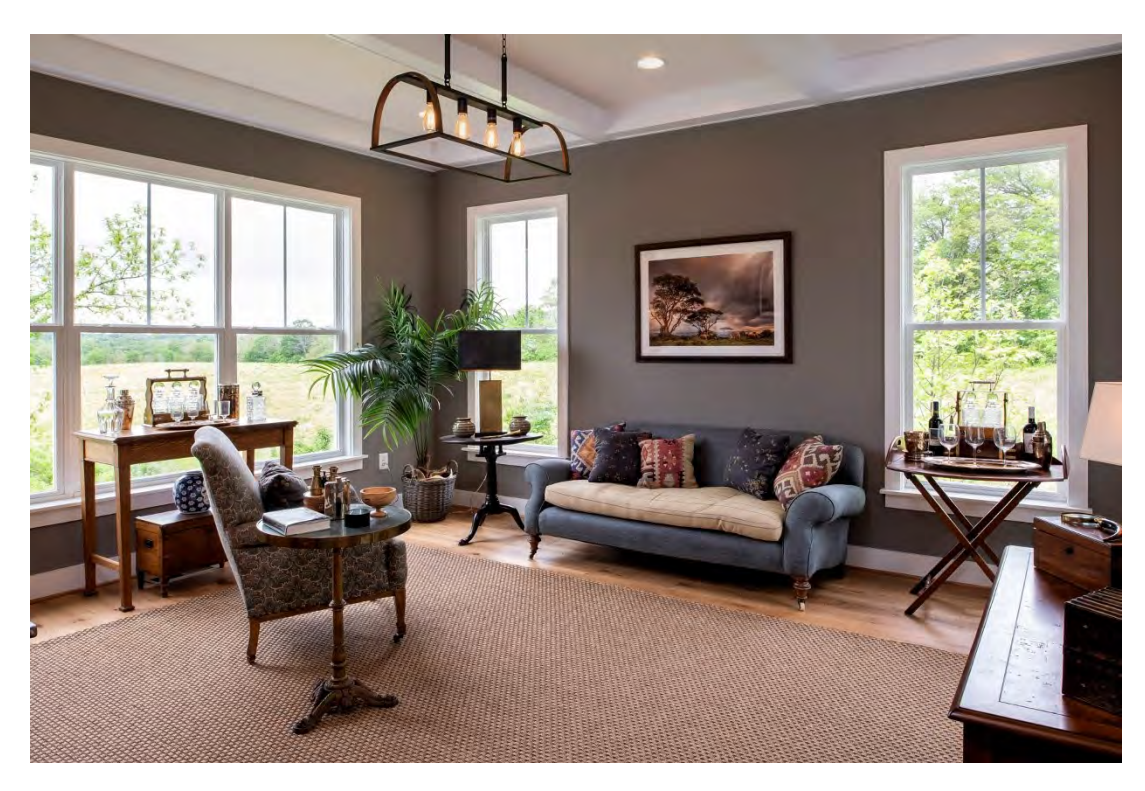
Flex room can be optioned into a club room with beamed ceiling