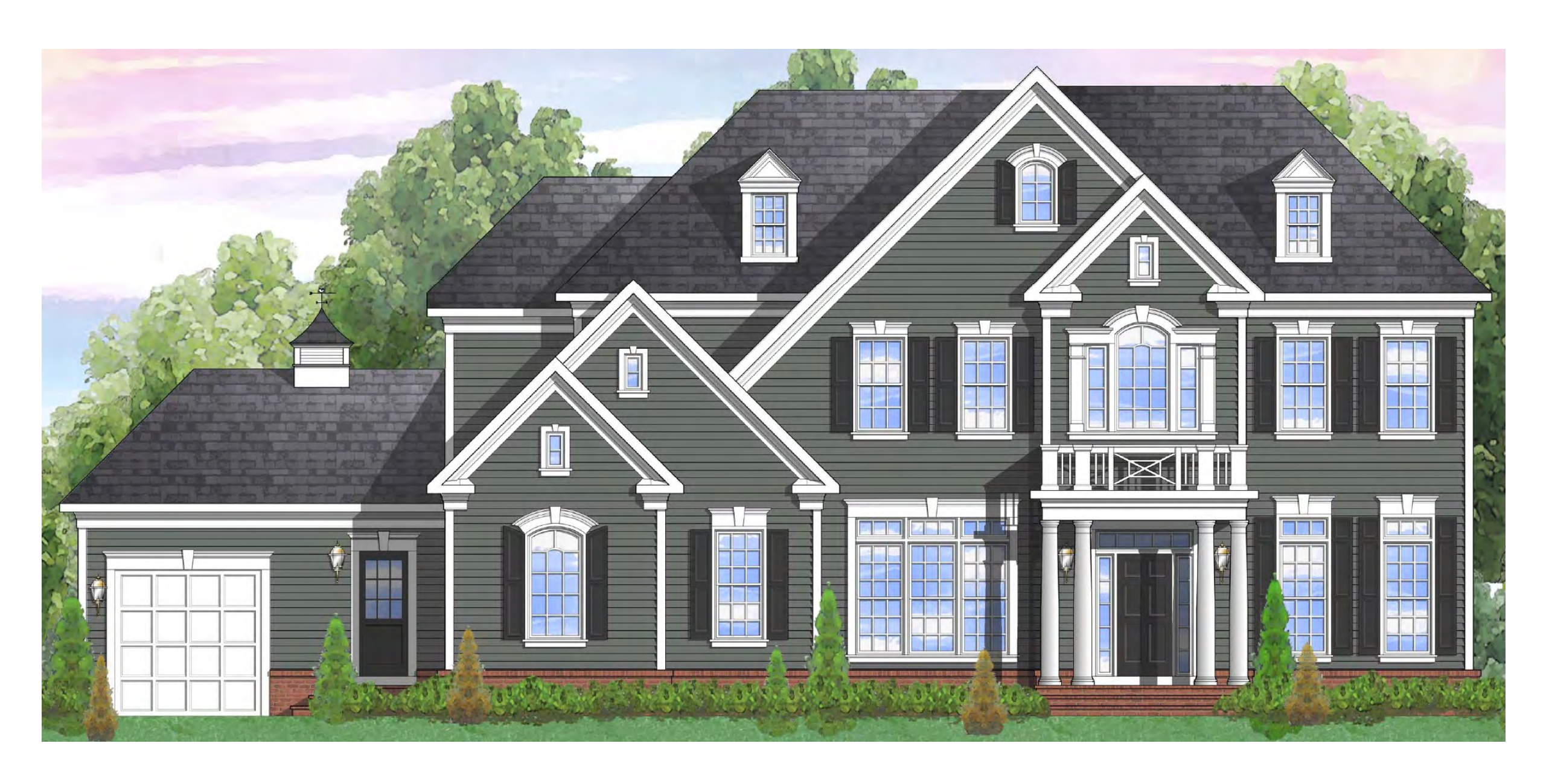
Elevation 17A shown with optional three-car garage and cupola with weathervane