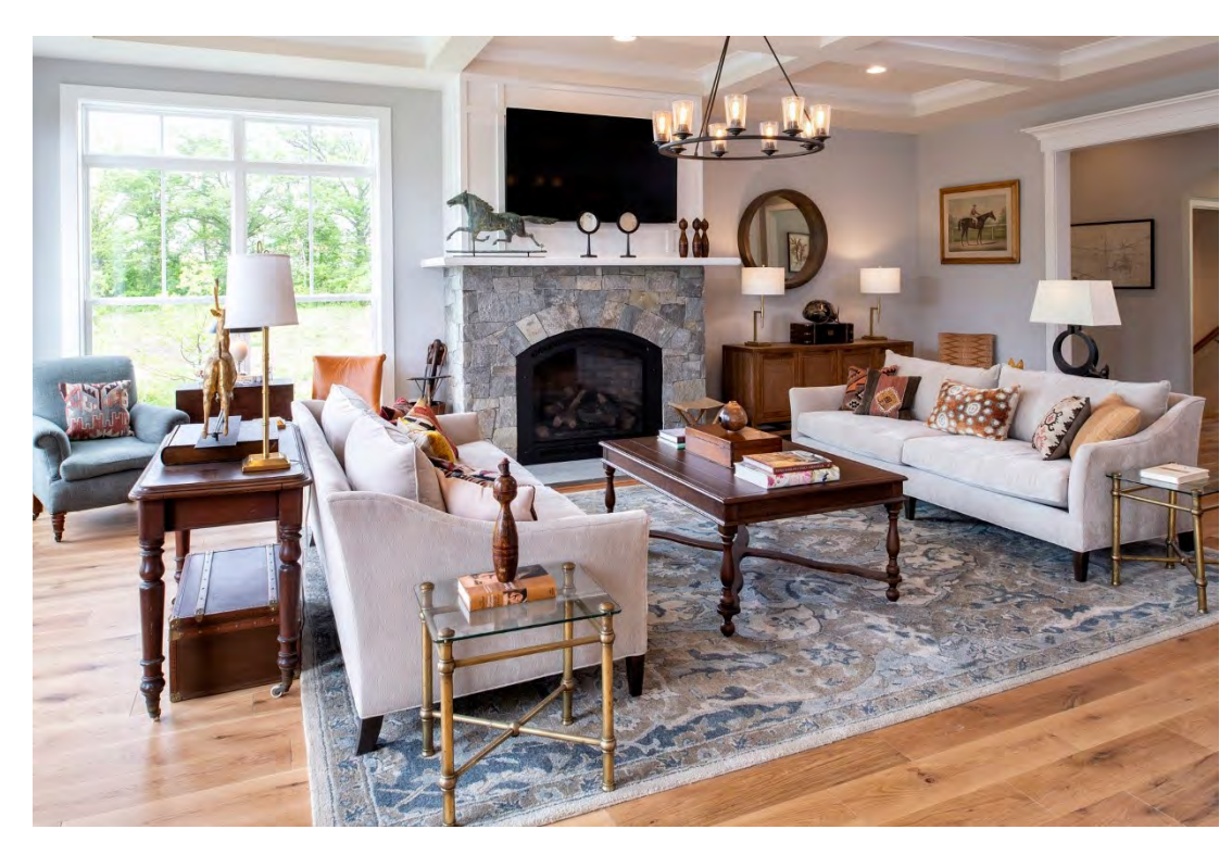
Expanded family room with optional coffered ceiling and stone fireplace