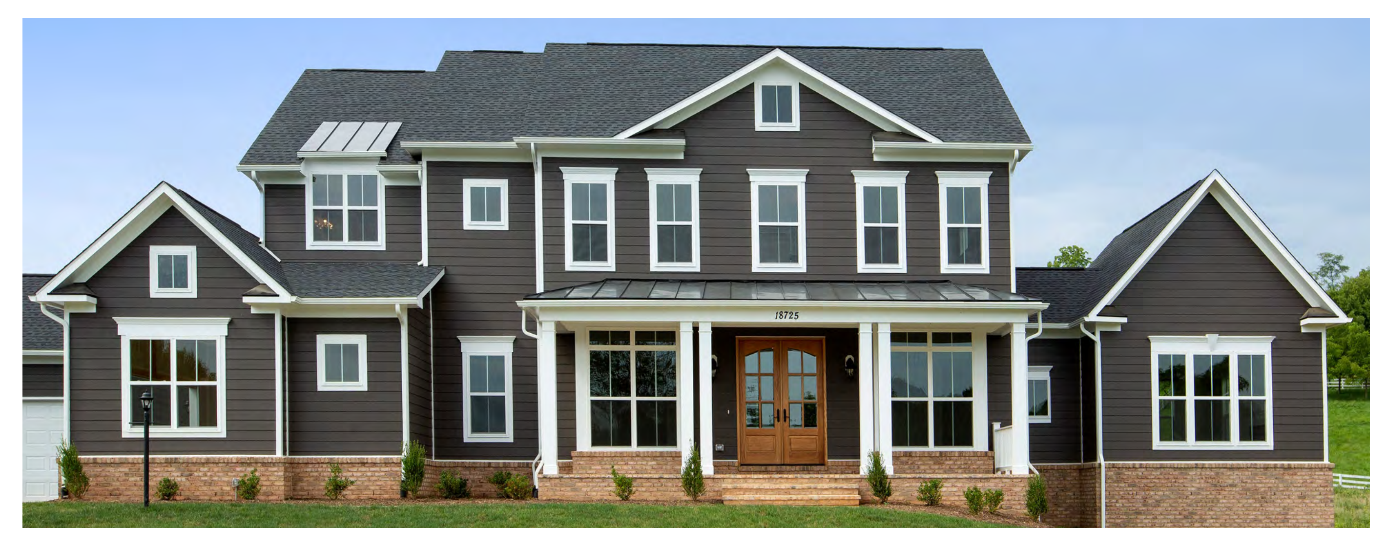
Elevation 9B shown with optional double mahogany doors and side club room