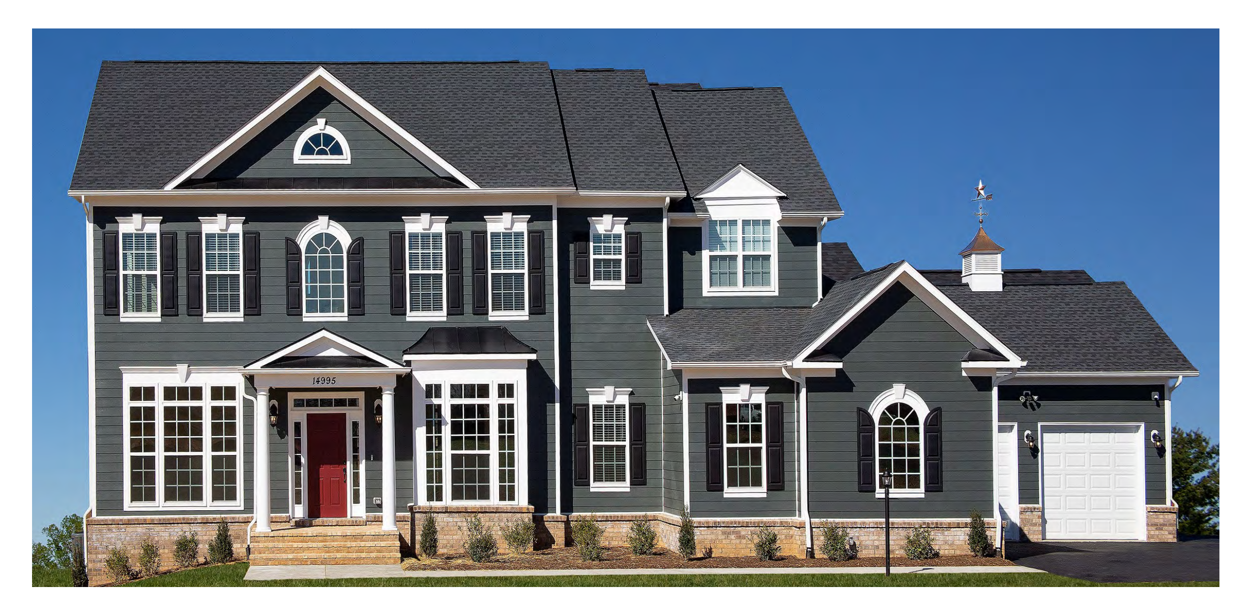
Elevation 2A shown with optional four-car garage and cupola with weathervane