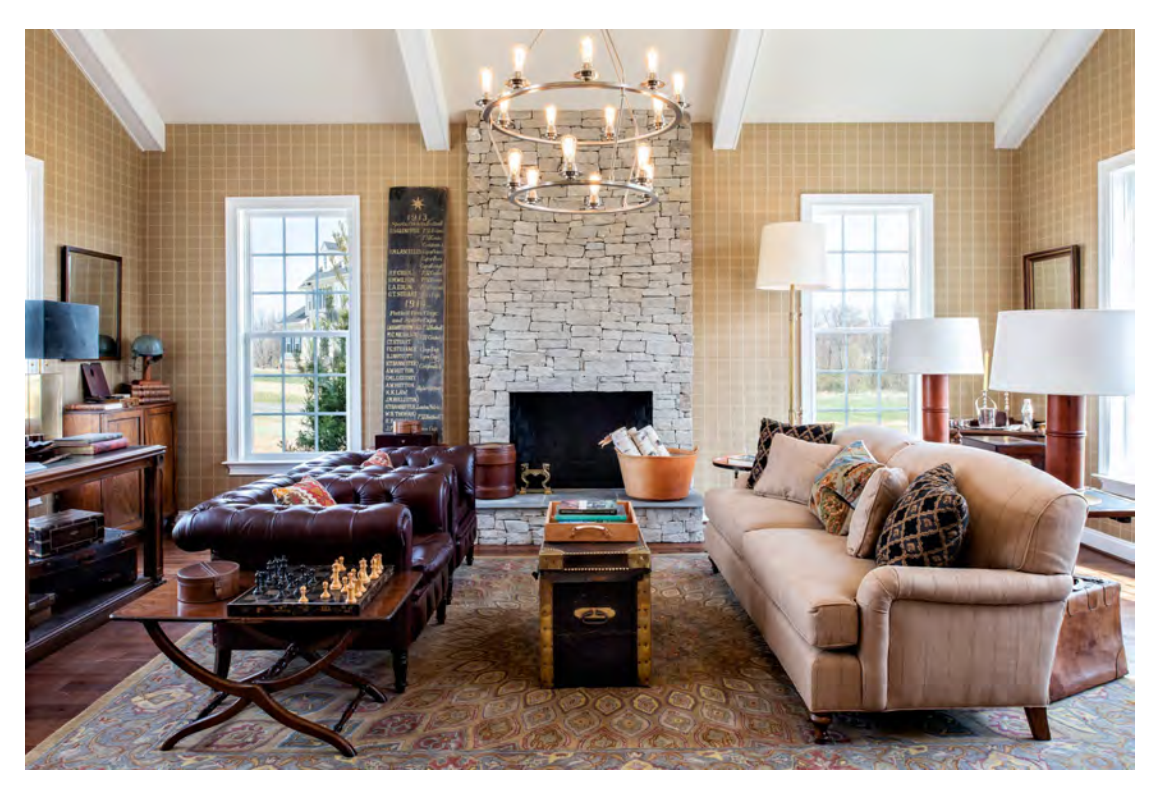
Optional side club room shown with stone masonry fireplace