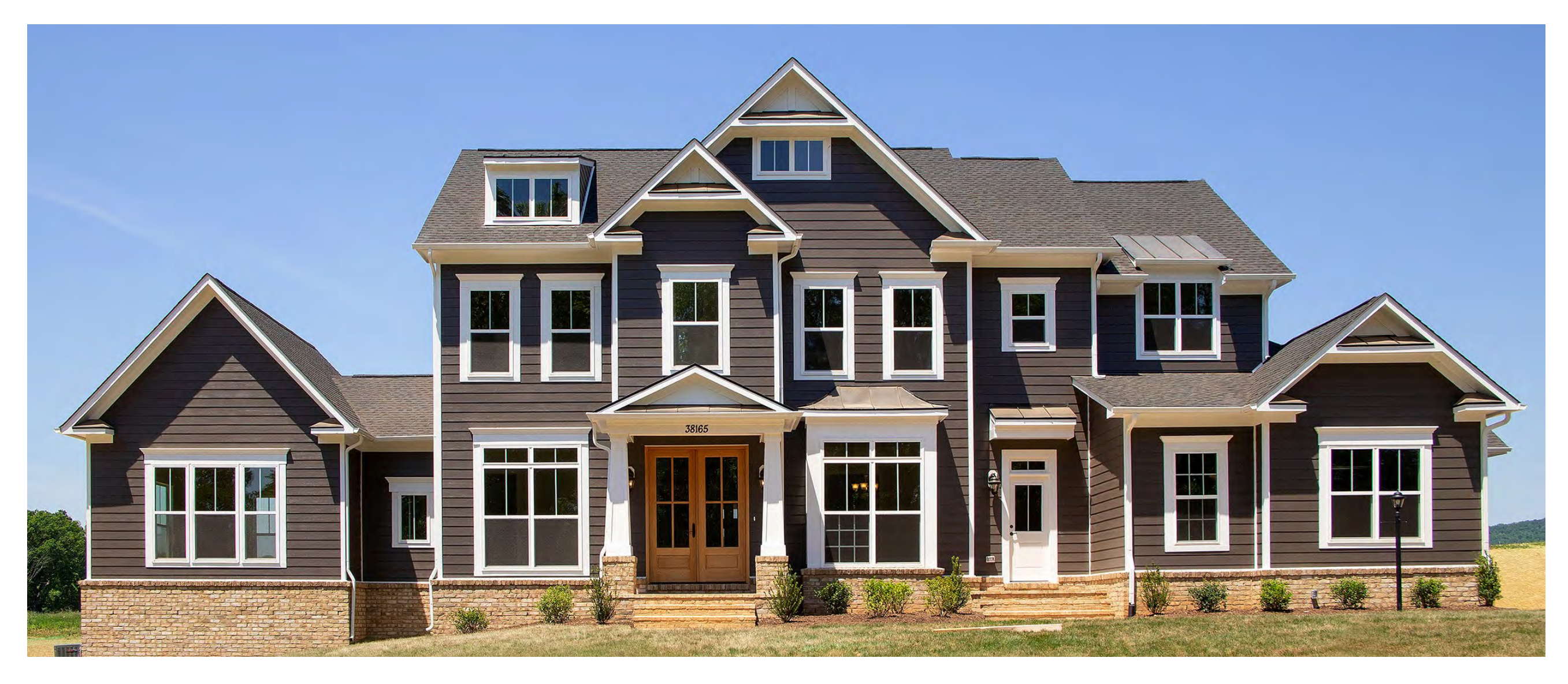
Elevation 5A with shown with optional double mahogany front doors, service entrance, and side club room