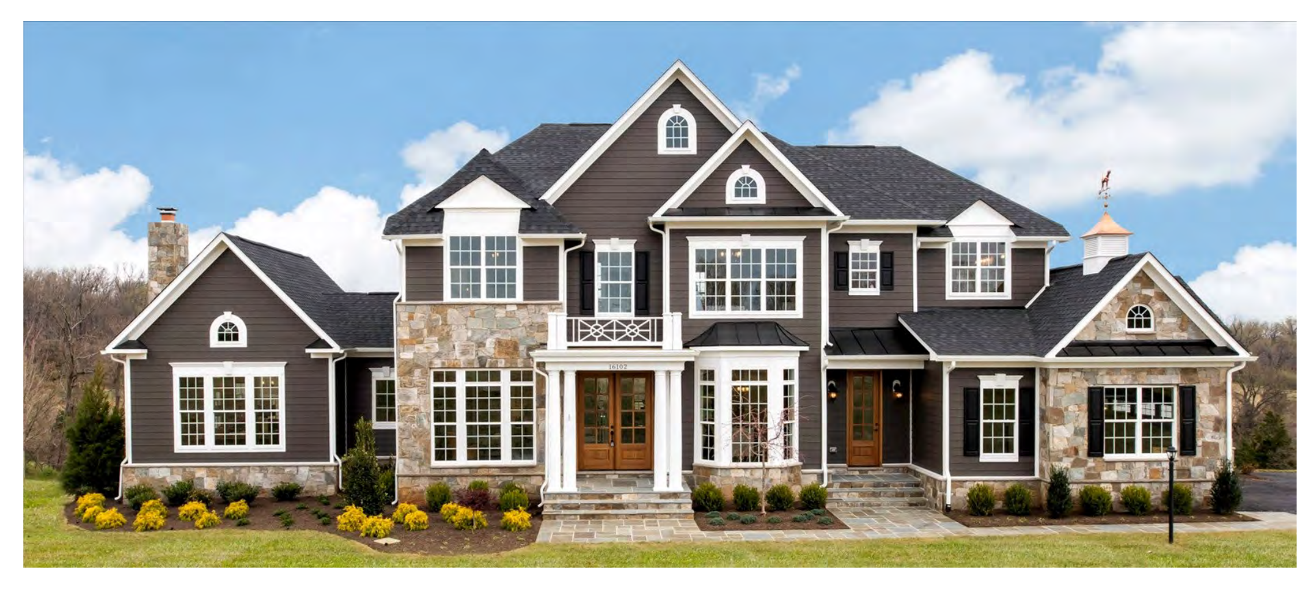
Elevation 7A shown with optional stone, mahogany doors, service entrance, and side club room