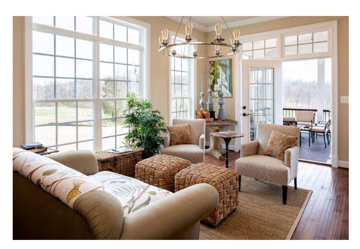
Optional rear club room with French doors leading to screened porch