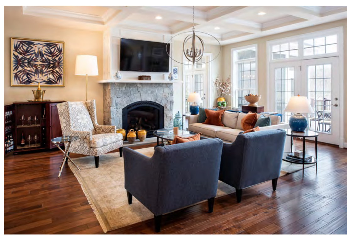
Family room shown with optional coffered ceiling, stone fireplace, and French doors