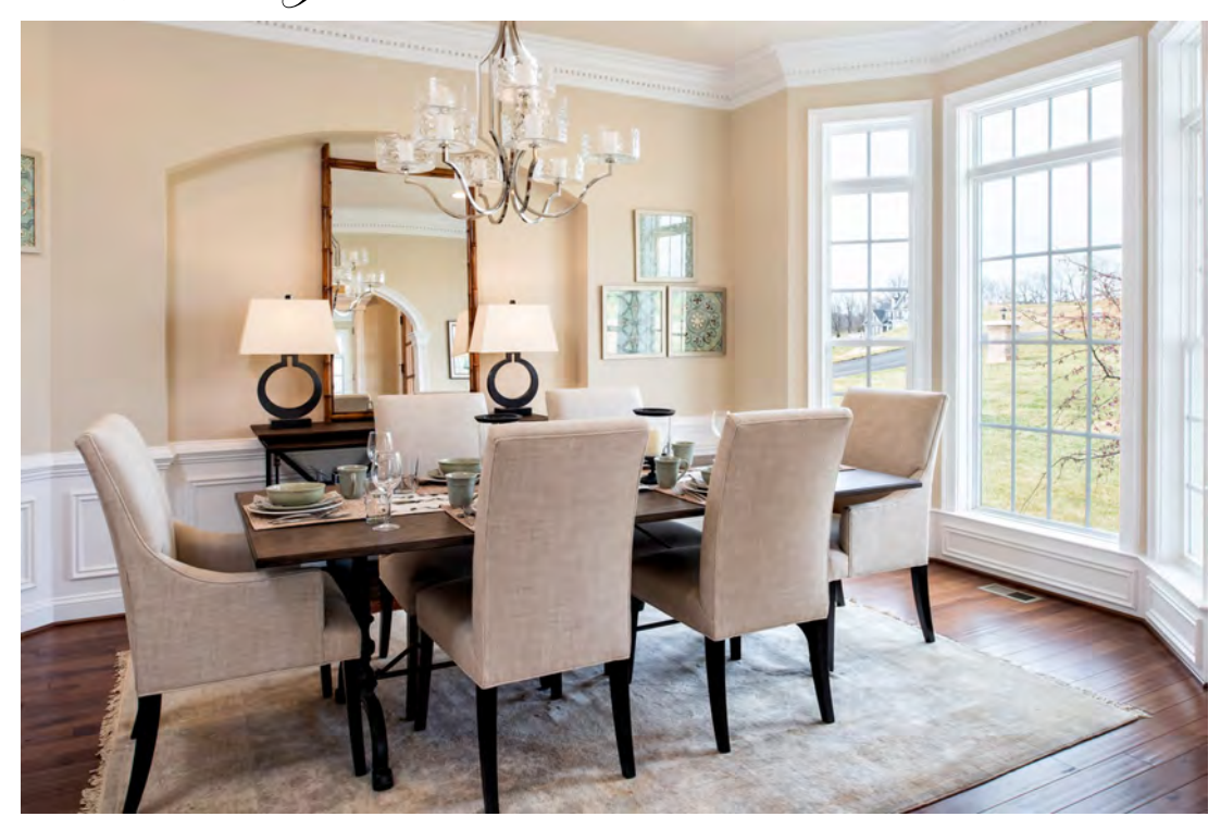
Dining room with full height bay window and decorative art niche