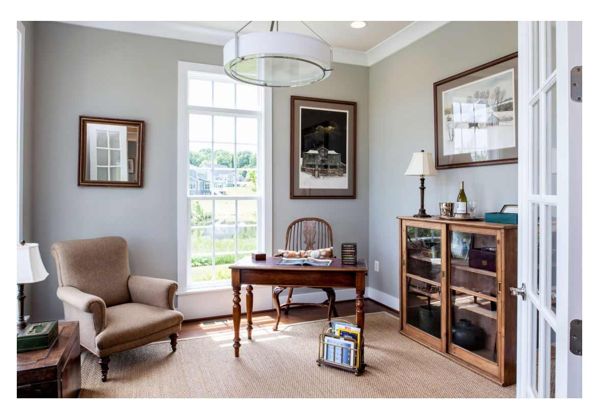
Library shown with double French doors and optional side window