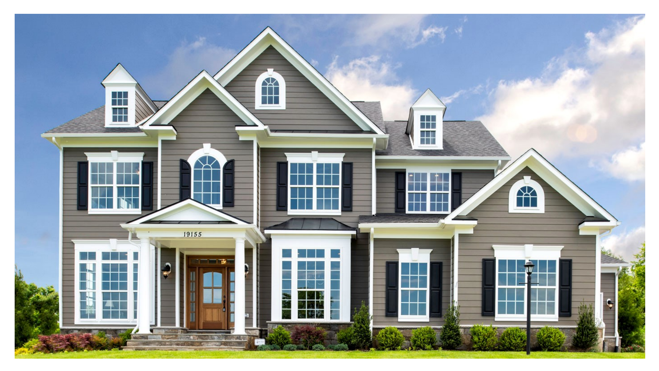
Elevation 4A shown with optional stone, mahogany front door, and three-car garage