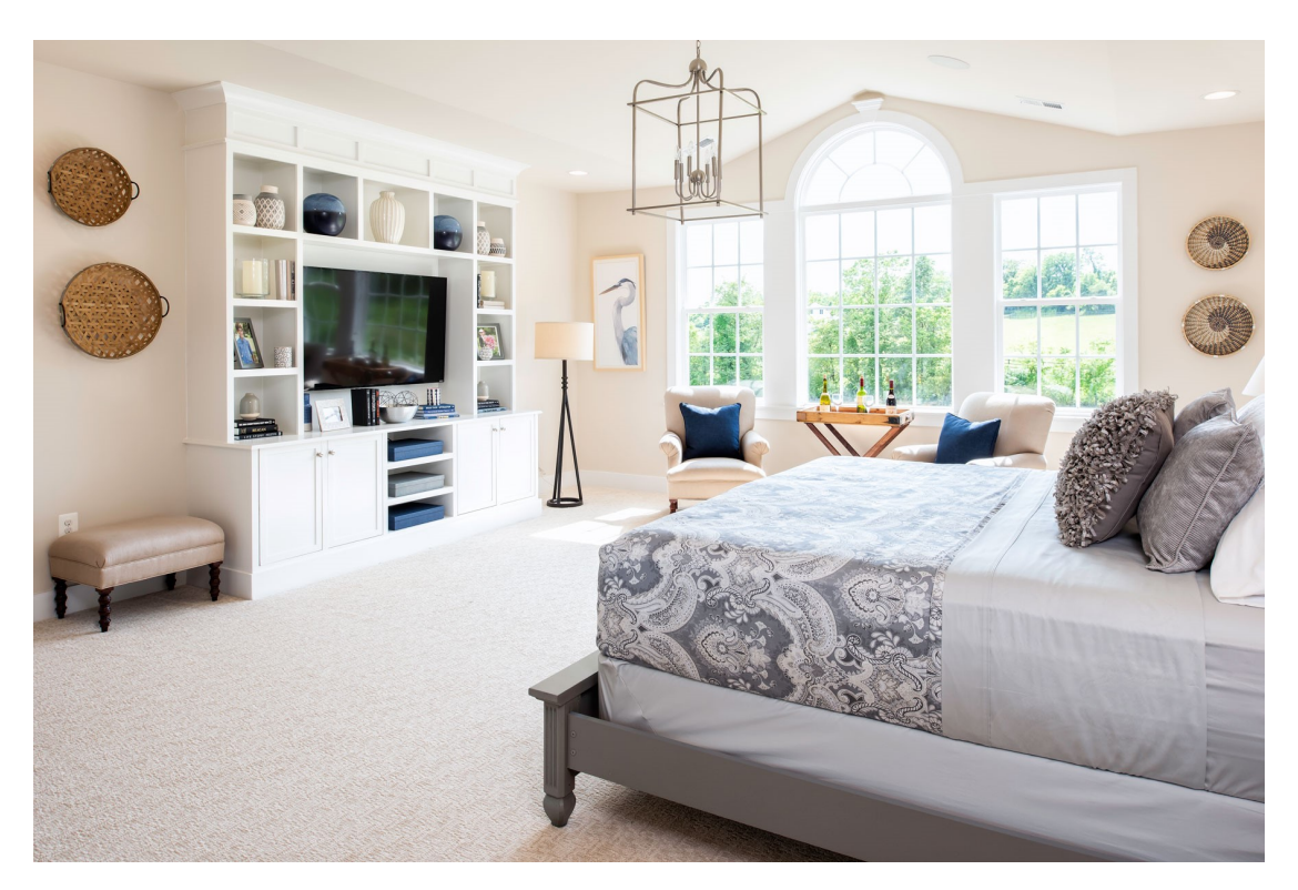
Owner's suite with vaulted ceiling, beautiful arch-topped windows, and custom built-ins

Photos of decorated model homes show structural and product options that are not included in the base price of a home. Photos are for illustrative and informational purposes only and are not part of or included in any contract. Blueprints take precedence over marketing materials. Plans, elevations, standard features, and options are subject to change without notice. See Sales Manager for details. 6/4/2021