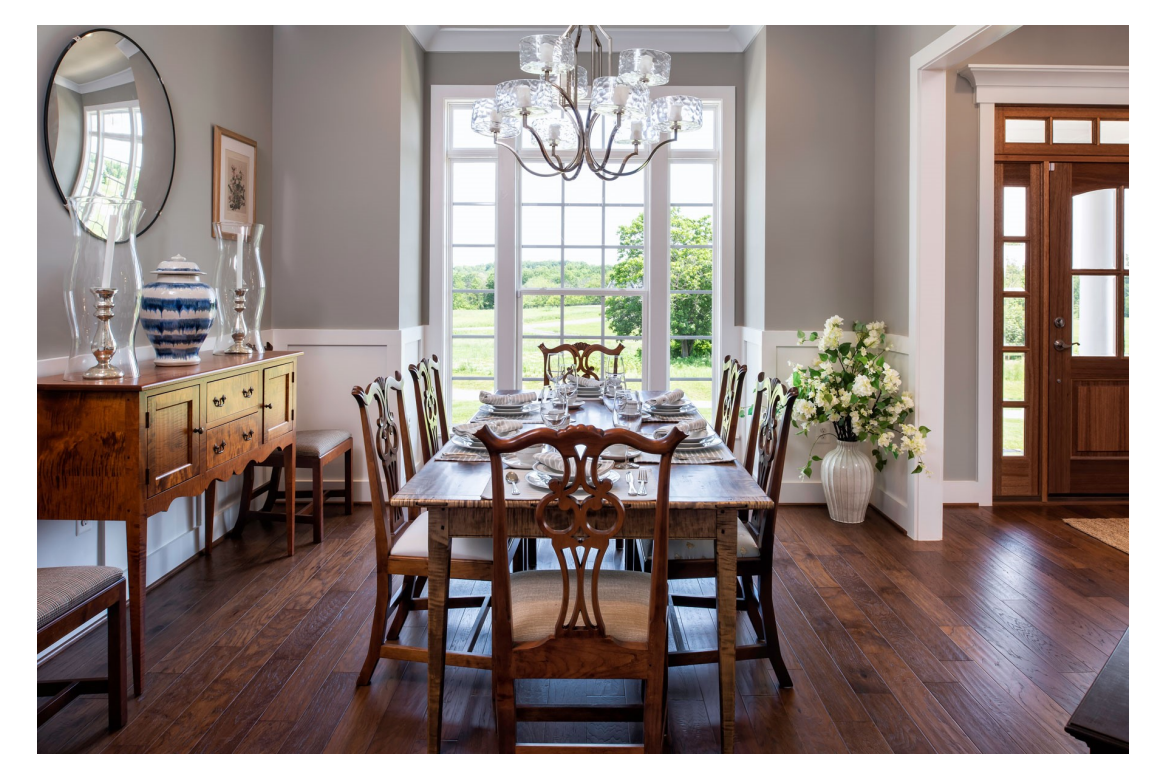
Dining room with craftsman trim, upgraded lighting, and full box bay window