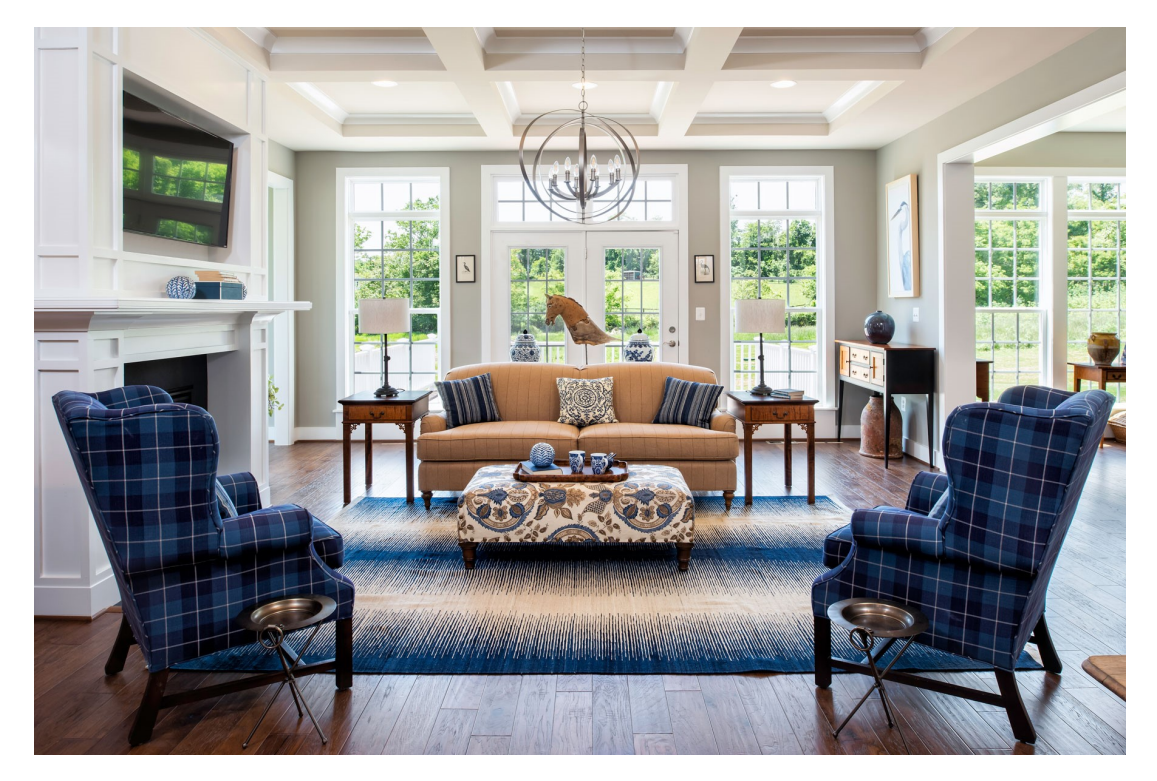
Family room with optional coffered ceiling, craftsman fireplace, and French doors