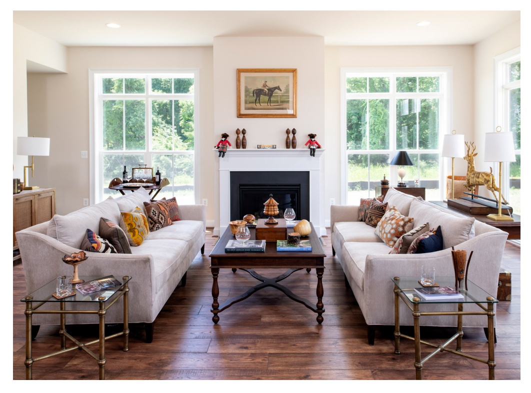
Extended family room with gas fireplace and optional windows