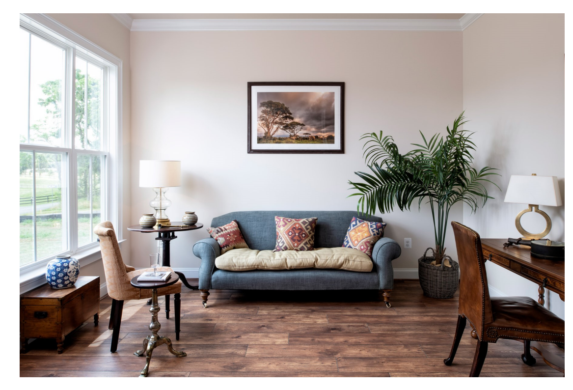
Library with crown moulding

Photos of decorated model homes show structural and product options that are not included in the base price of a home. Photos are for illustrative and informational purposes only and are not part of or included in any contract. Blueprints take precedence over marketing materials. Plans, elevations, standard features, and options are subject to change without notice. See Sales Manager for details. 6/4/2021