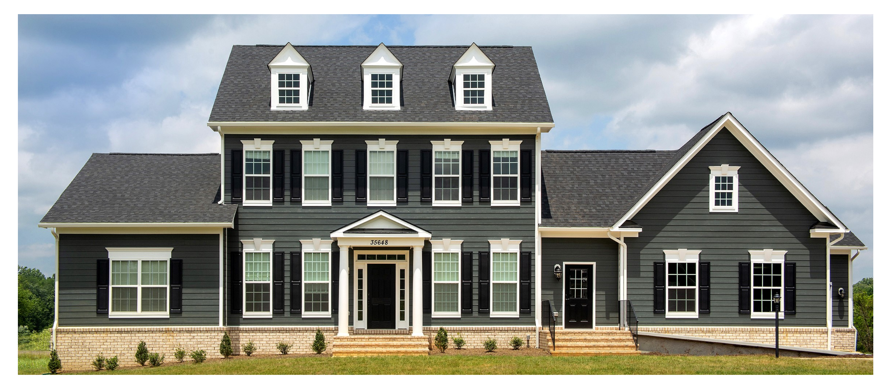
Elevation 1A shown with optional dormers, mudroom entrance, and three-car garage