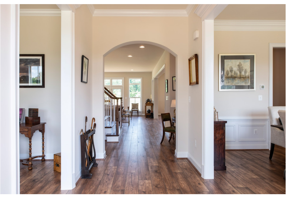
Foyer with cased openings into library and dining room