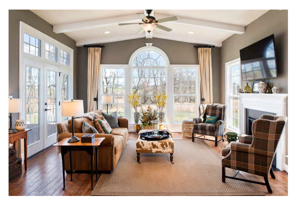
Optional keeping room with window wall, gas fireplace, and French doors