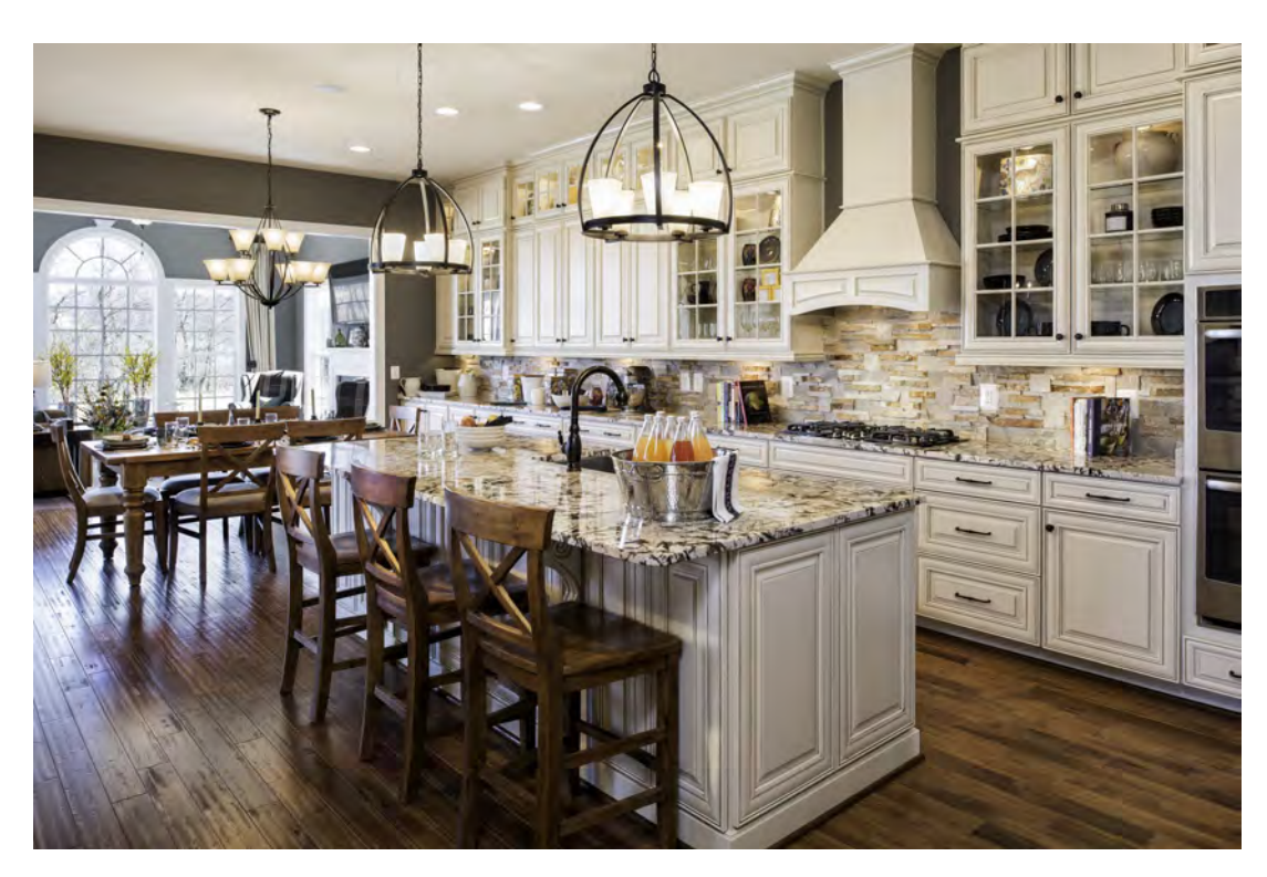
Chef's kitchen with upgraded stacked and glass cabinetry, upgraded backsplash, granite countertops, and optional keeping room