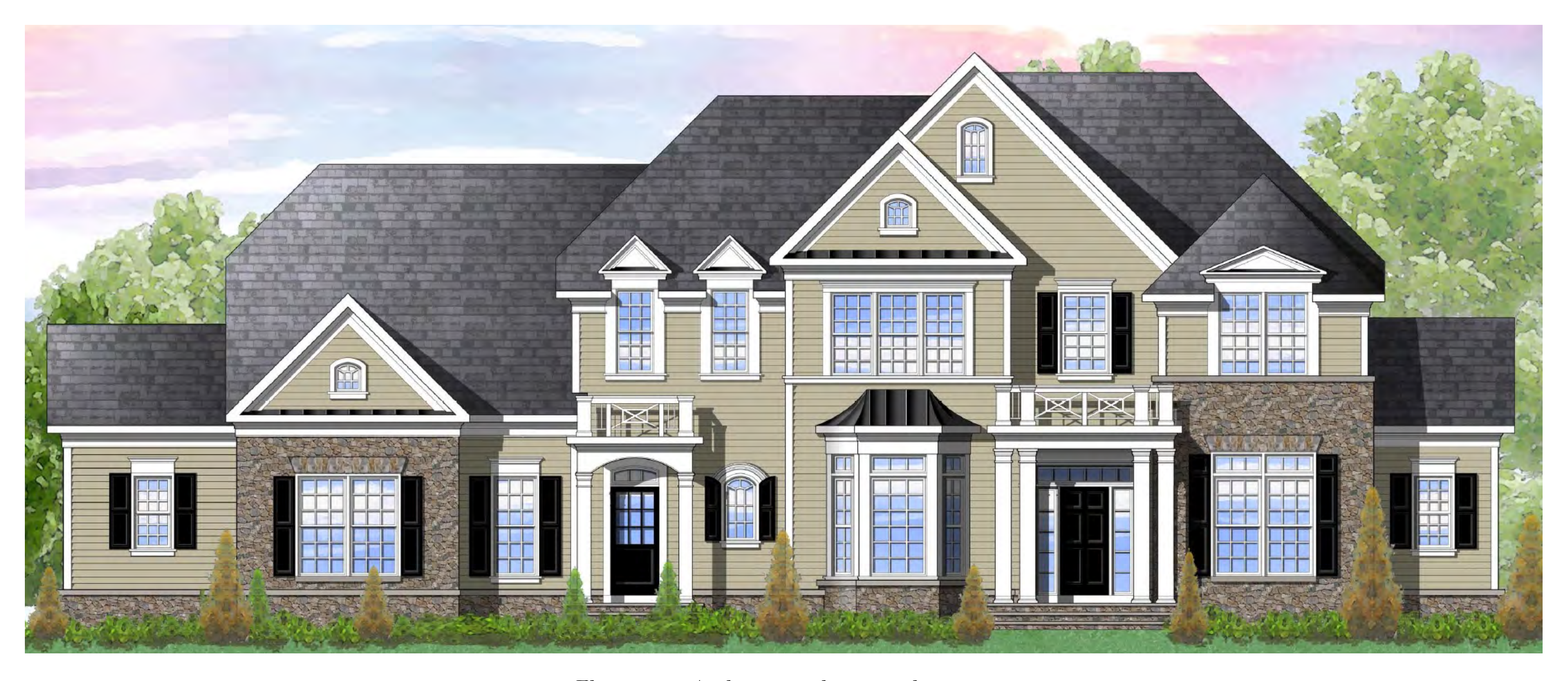
Elevation 13A shown with optional stone