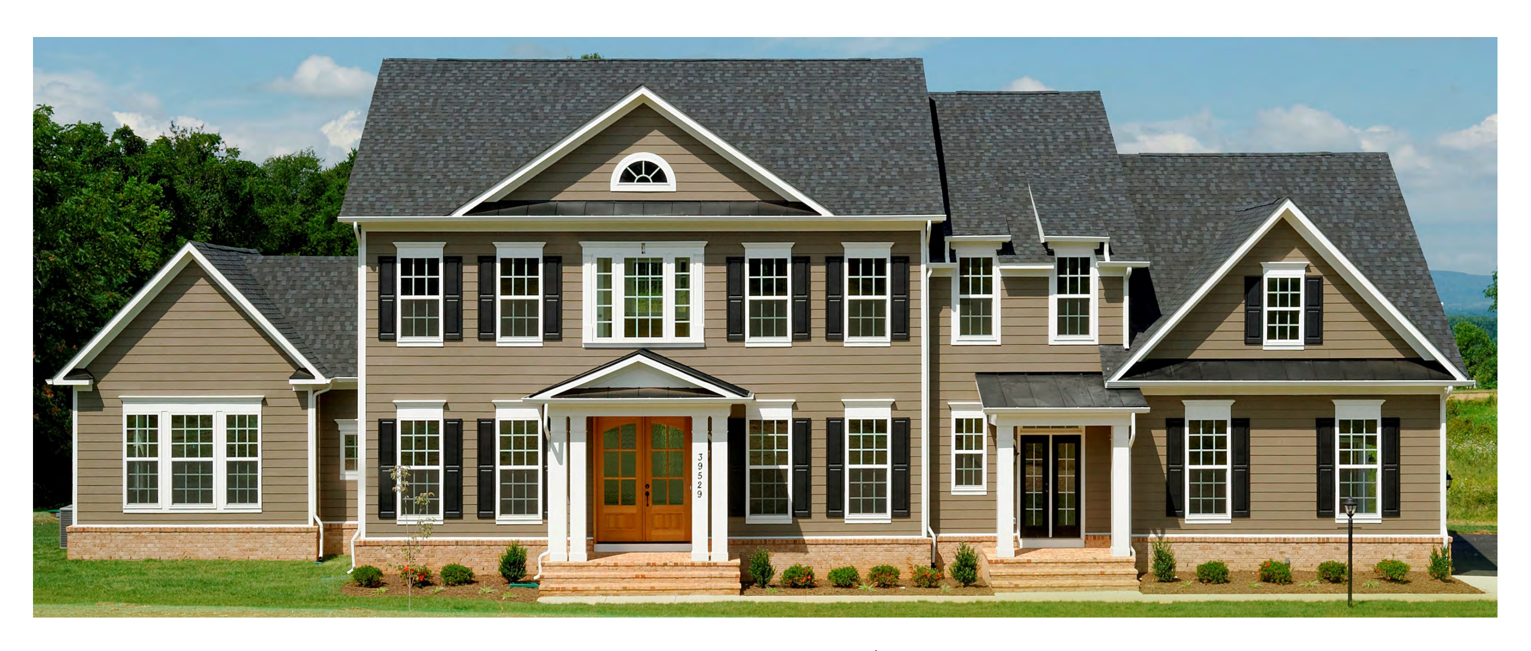
Elevation 1A shown with optional double mahogany front doors and side club room