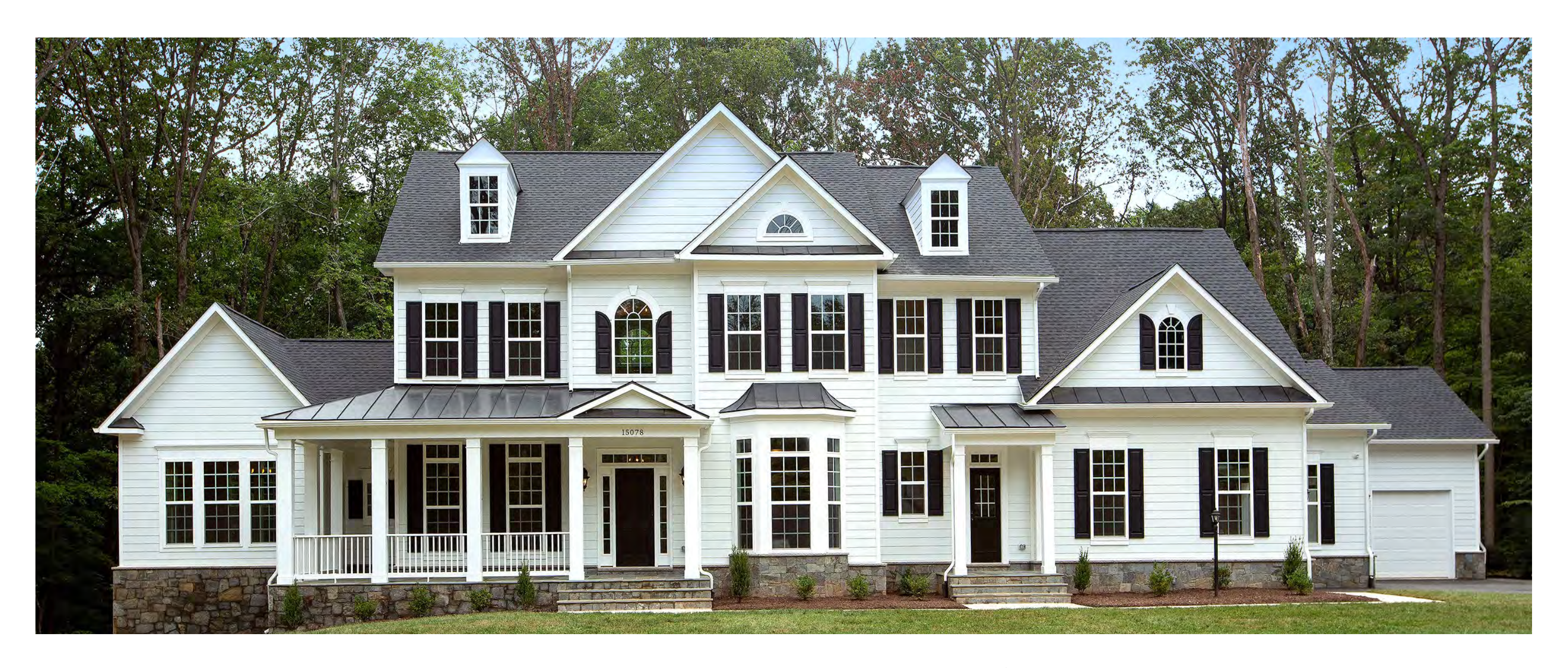
Elevation 6C shown with optional stone, side clubroom, and four-car garage