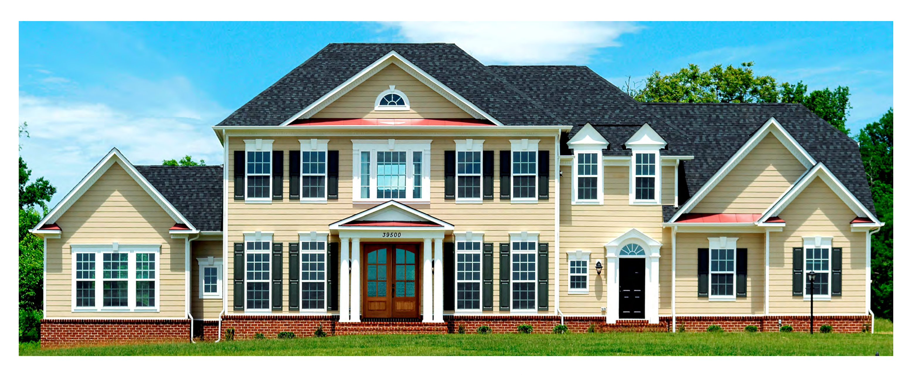
Elevation 4A shown with optional double mahogany front doors and side club room