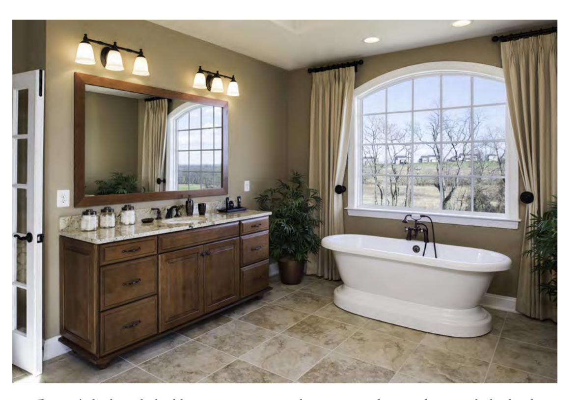
Owner's bath with double vanities, oversized picture window, and optional plinth tub