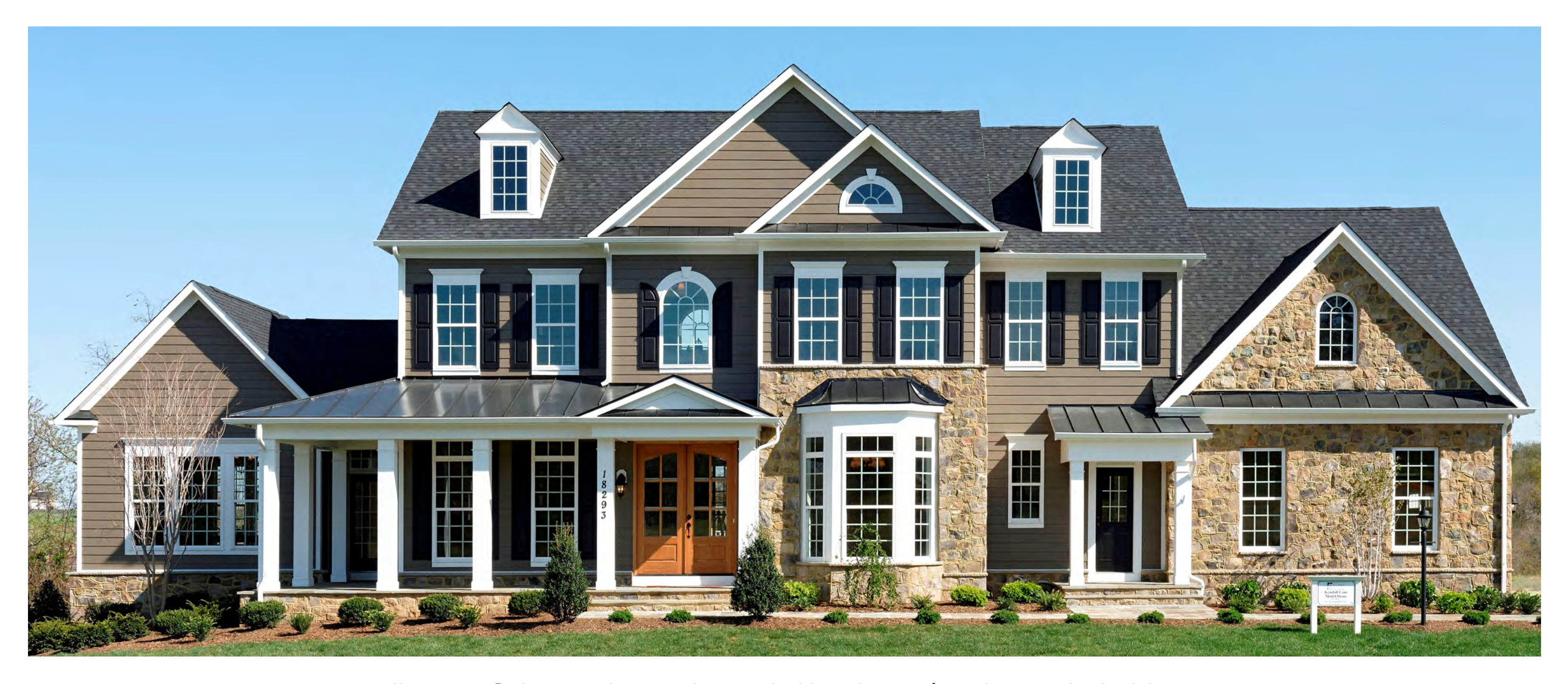
Elevation 6C shown with optional stone, double mahogany front doors, and side club room