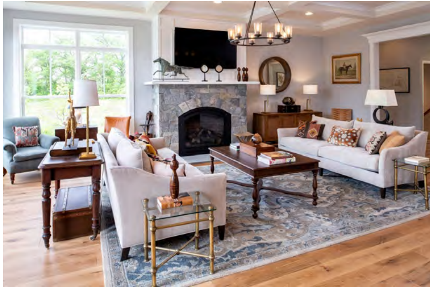
Expanded family room with optional coffered ceiling and stone fireplace