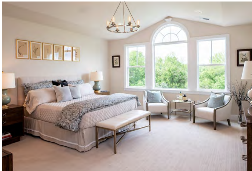
Owner's suite with vaulted ceiling and arched window wall