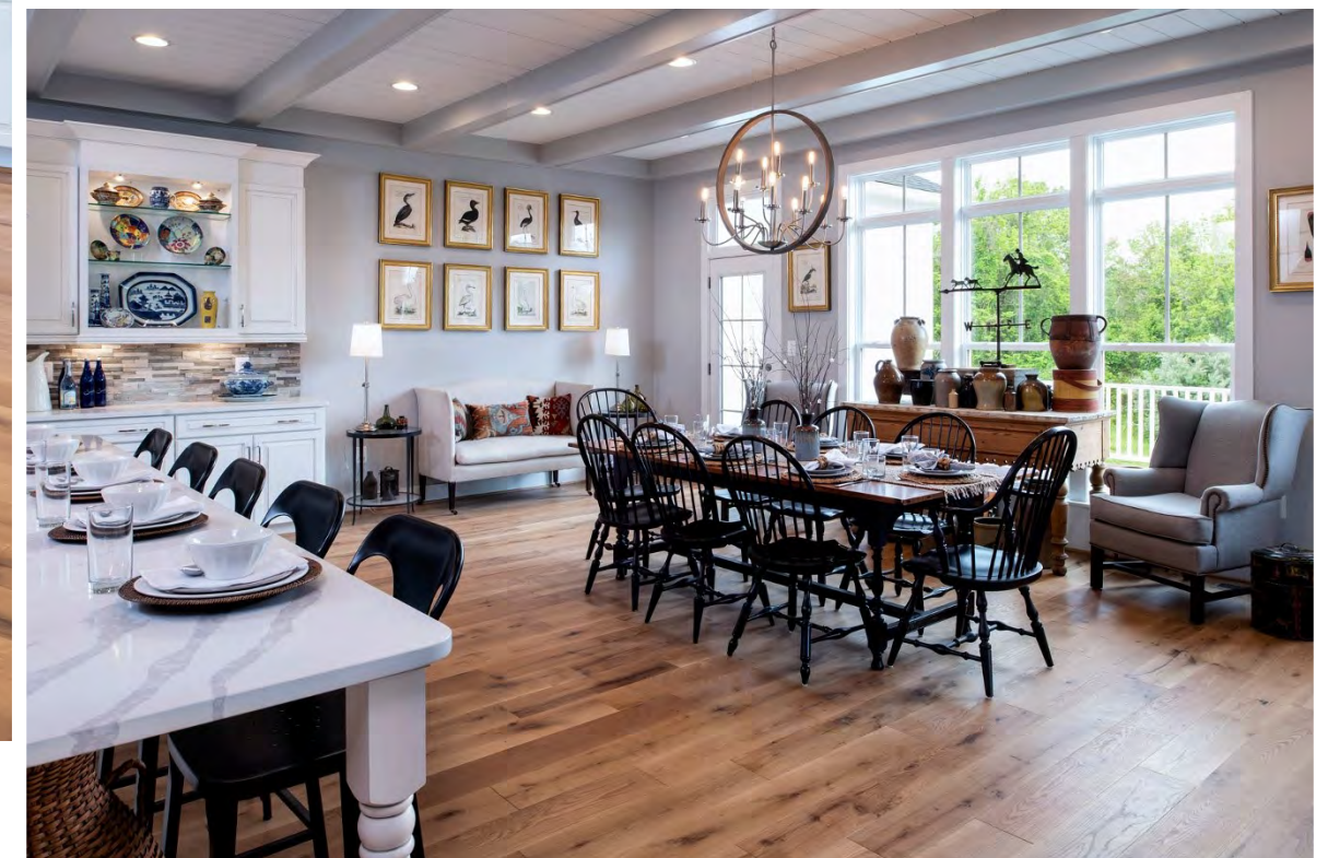
Carrington Farmhouse Kitchen shown with extended kitchen island, shiplap and beamed ceiling, upgraded cabinetry, lighting, backsplash, and quartz countertops

Photos of decorated model homes show structural and product options that are not included in the base price of a home. Photos are for illustrative and informational purposes only and are not part of or included in any contract. Blueprints take precedence over marketing materials. Plans, elevations, standard features, and options are subject to change without notice. See Sales Manager for details. 7/28/2021