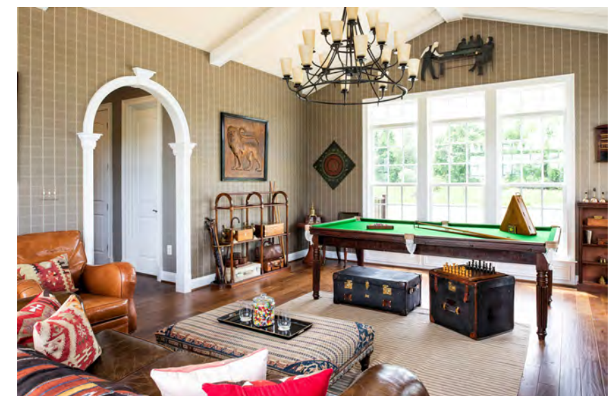
Optional side club room with vaulted beamed ceiling

Photos of decorated model homes show structural and product options that are not included in the base price of a home. Photos are for illustrative and informational purposes only and are not part of or included in any contract. Blueprints take precedence over marketing materials. Plans, elevations, standard features, and options are subject to change without notice. See Sales Manager for details. 7/28/2021