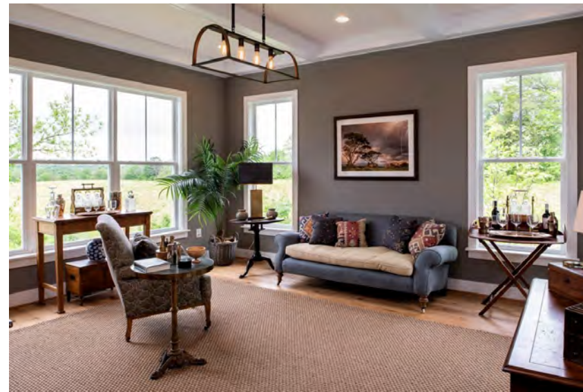
Flex room can be optioned into a larger club room with beamed ceiling