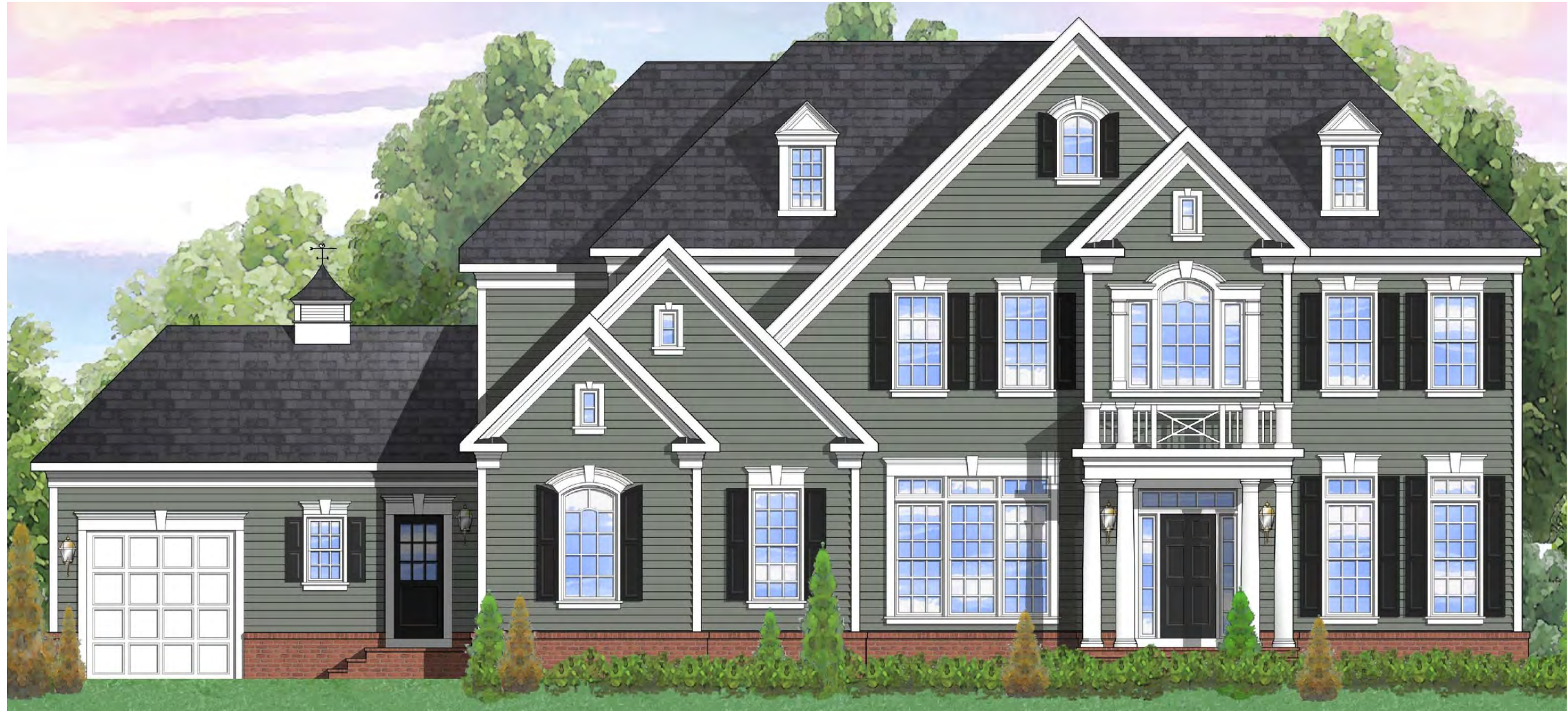
Elevation 2A shown with optional cupola with weathervane