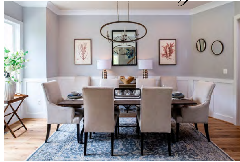
Dining room with box bay window and craftsman trim