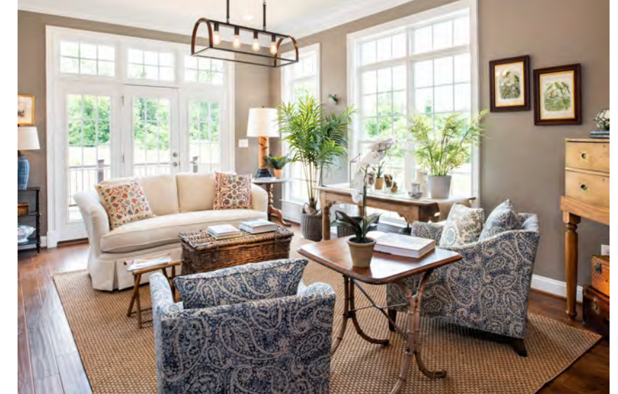
Optional rear club room