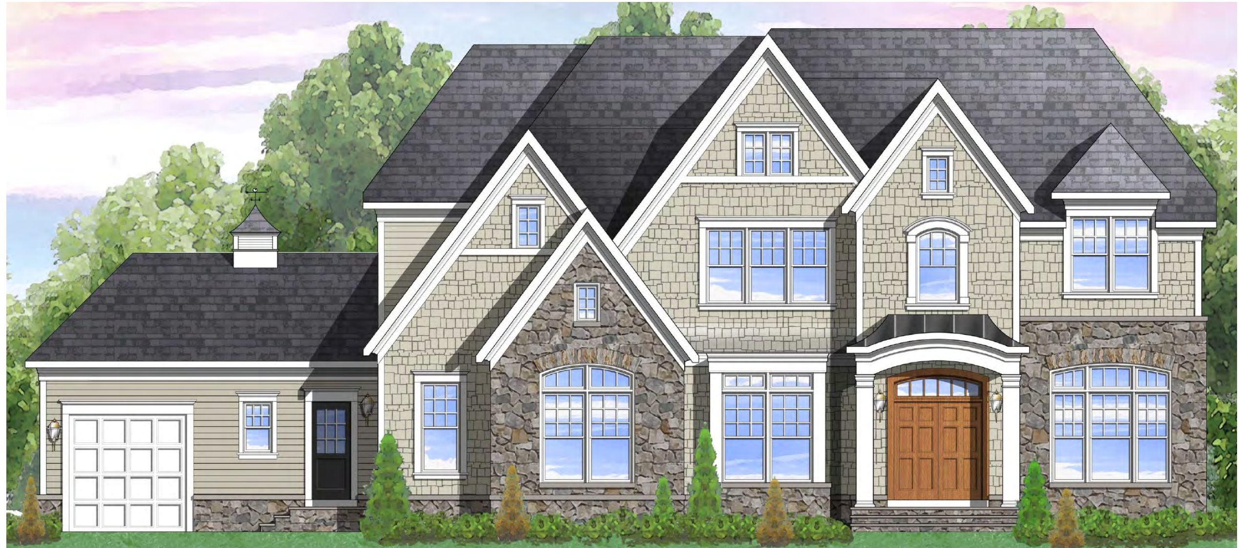
Elevation 5A shown with optional stone, double mahogany front doors, and cupola with weathervane