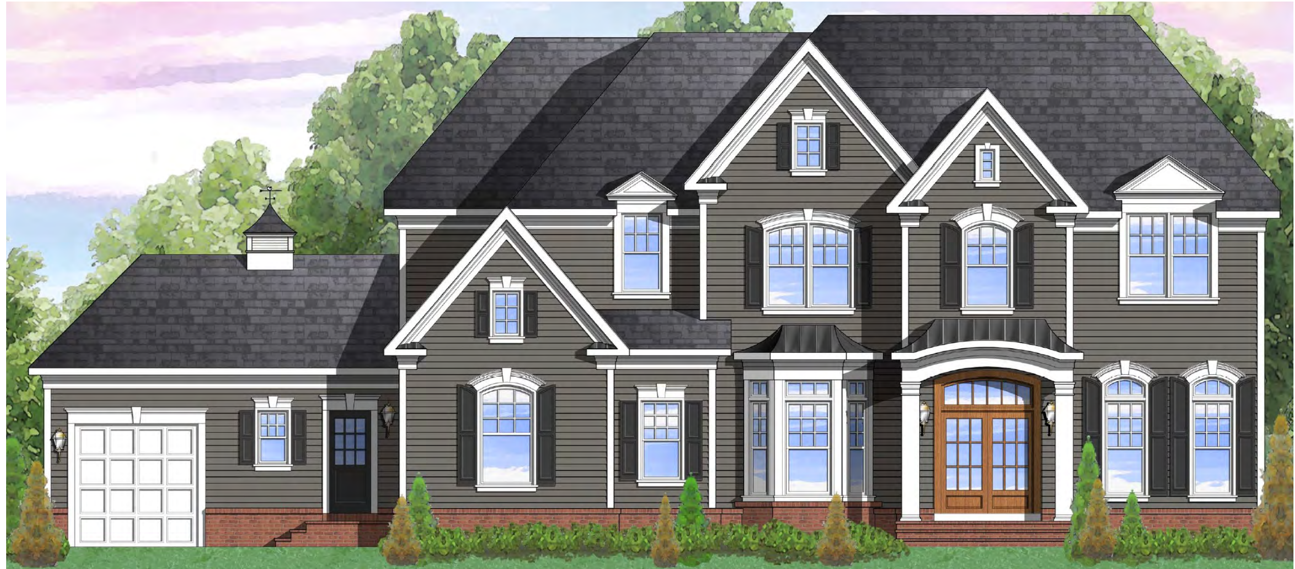
Elevation 11A shown with optional double mahogany front doors and cupola with weathervane