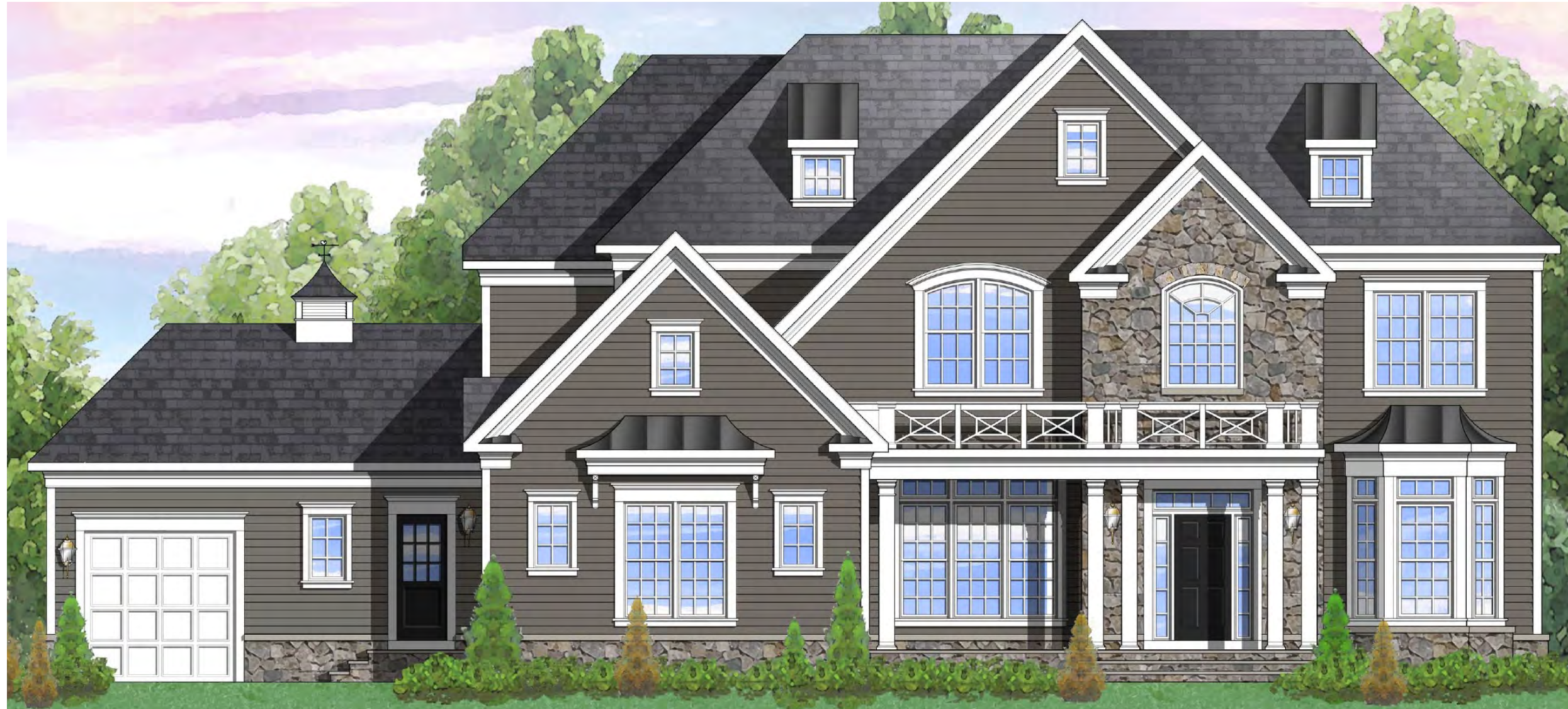
Elevation 4B shown with optional stone, front porch, and cupola with weathervane